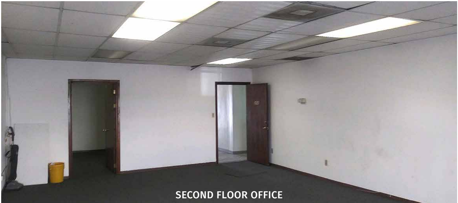
SECOND FLOOR OFFICE