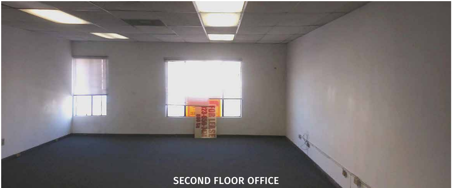
SECOND FLOOR OFFICE