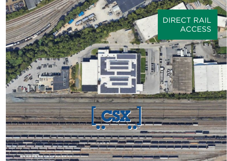
DIRECT RAIL ACCESS