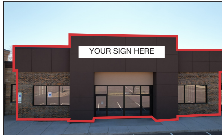
8525 W. 26th Street 4,773 SF