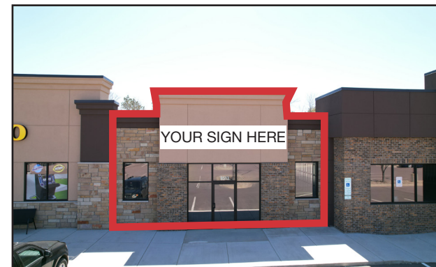
8513 W. 26th Street 2,152 SF