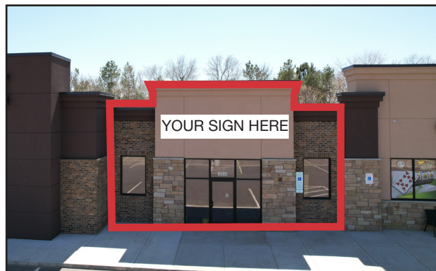
8505 W. 26th Street 2,152 SF

Build-to-Suit: Motivated landlord with in-house buildout capabilities