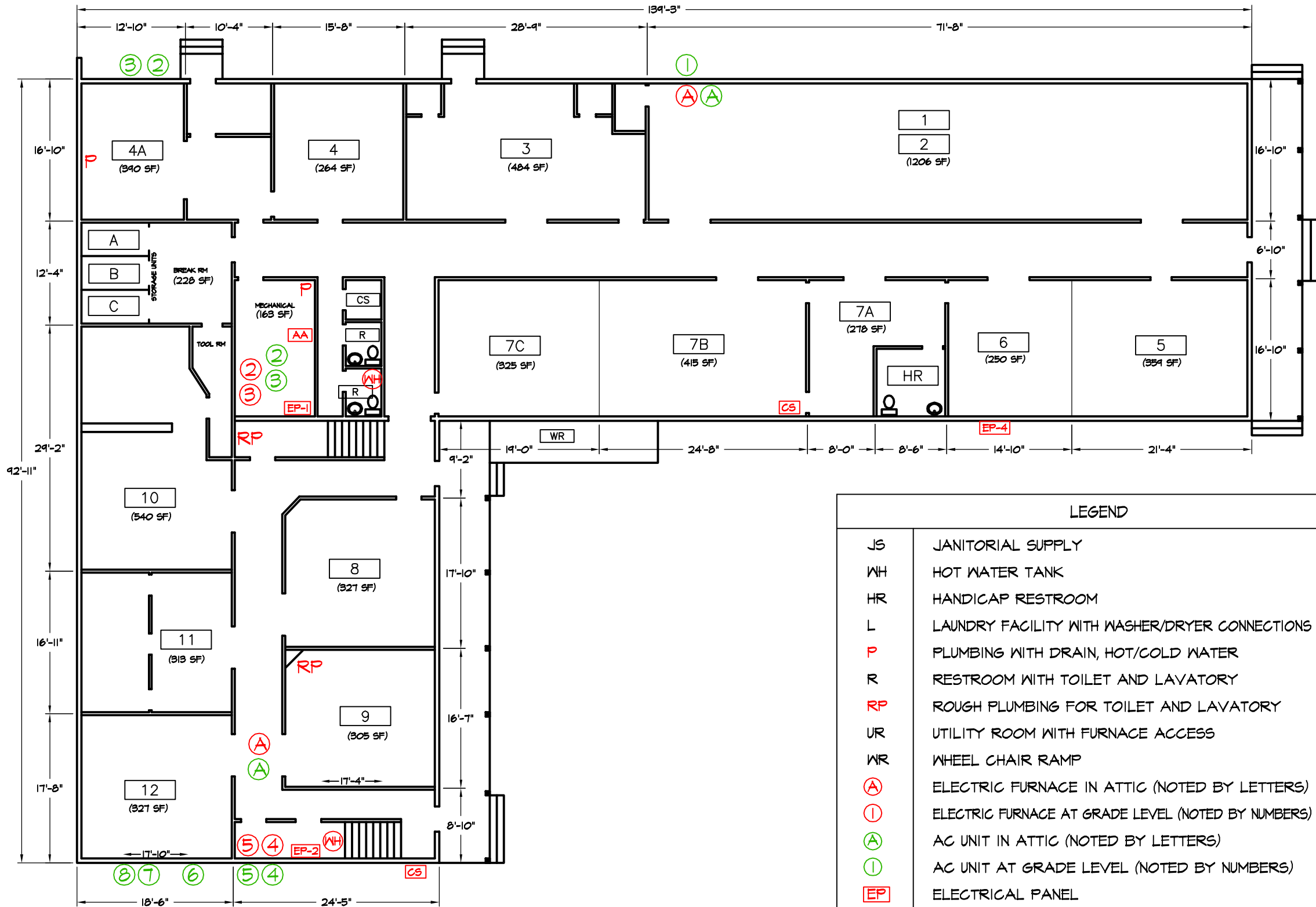
MAIN FLOOR PLAN SCALE: NONE