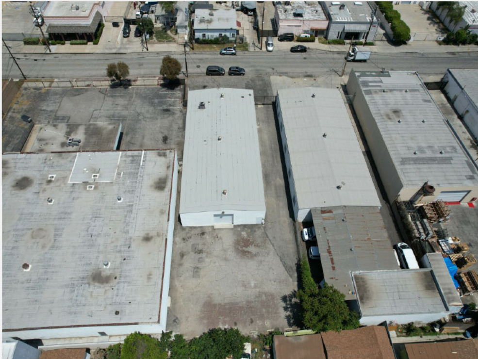
Back - GL