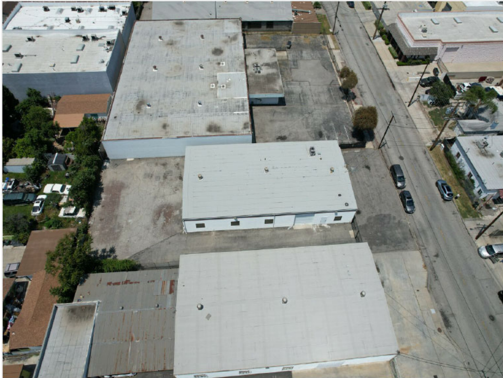
Side - GL