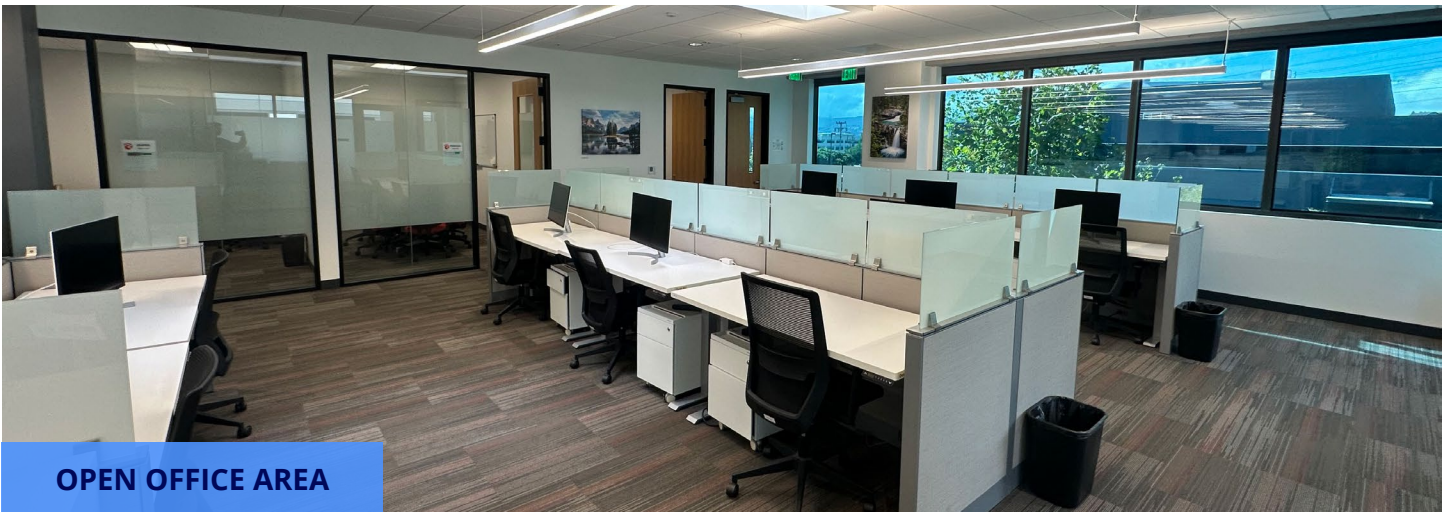
OPEN OFFICE AREA