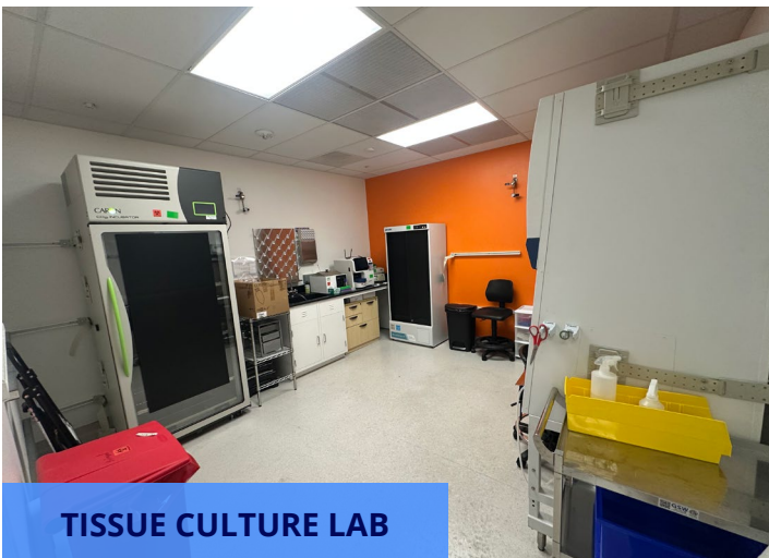
TISSUE CULTURE LAB