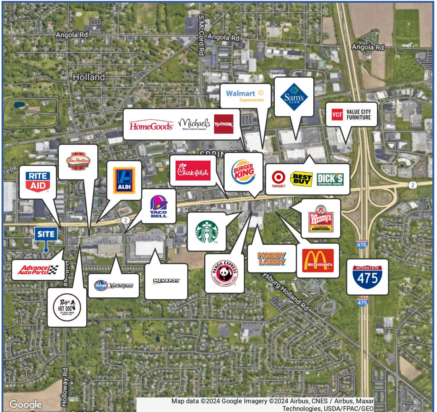
Map data ©2024 Google Imagery ©2024 Airbus, CNES / Airbus, Maxar Technologies, USDA/FPAC/GEO

KYLE JURGENSON 419.708.0835 kjurgenson@millerdiversified.com