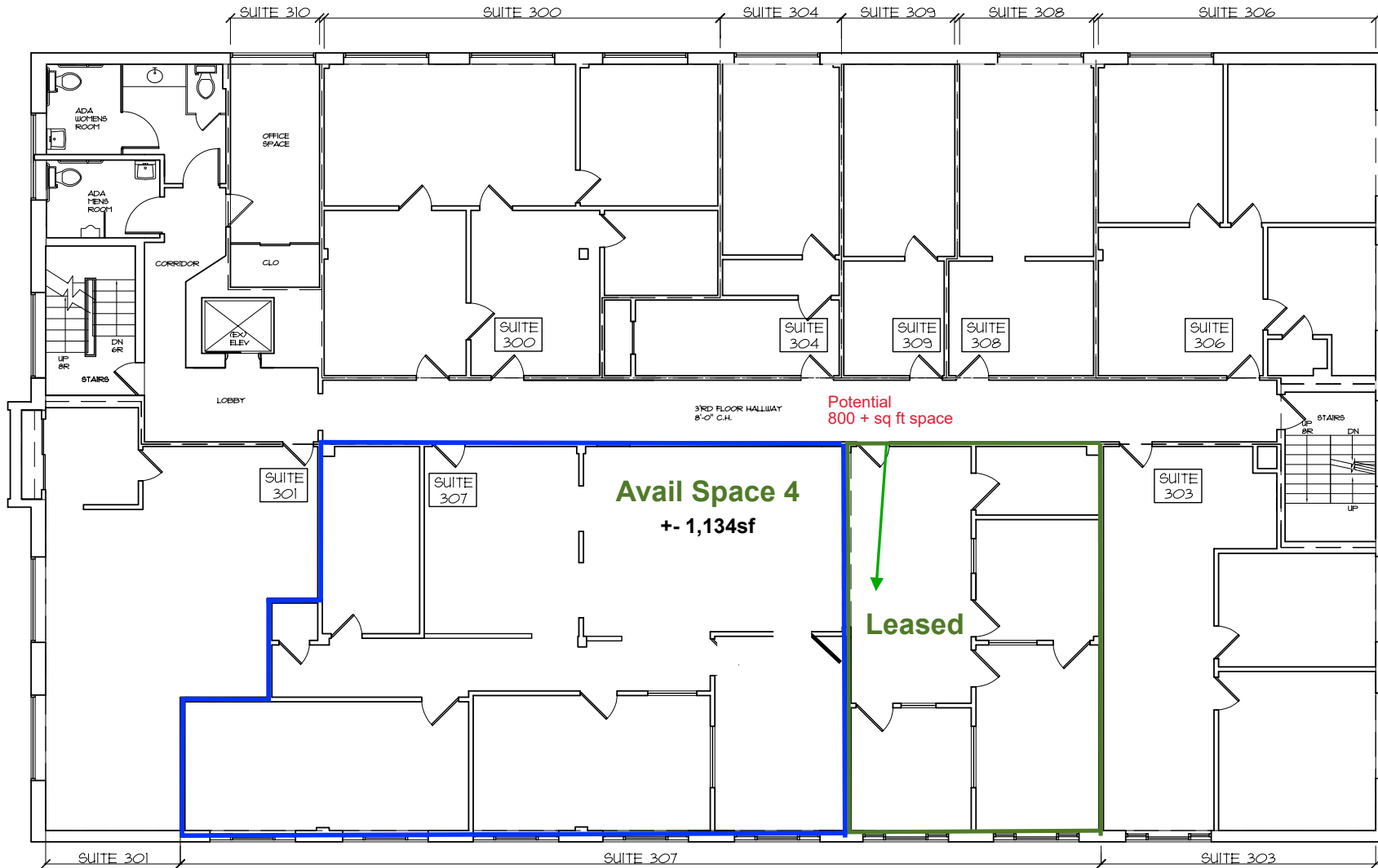
1 THIRD FLOOR PLAN EX-3 SCALE 1/8" = 1'-0"