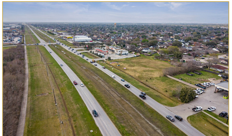
Street-level view — W Fairmont Pkwy frontage