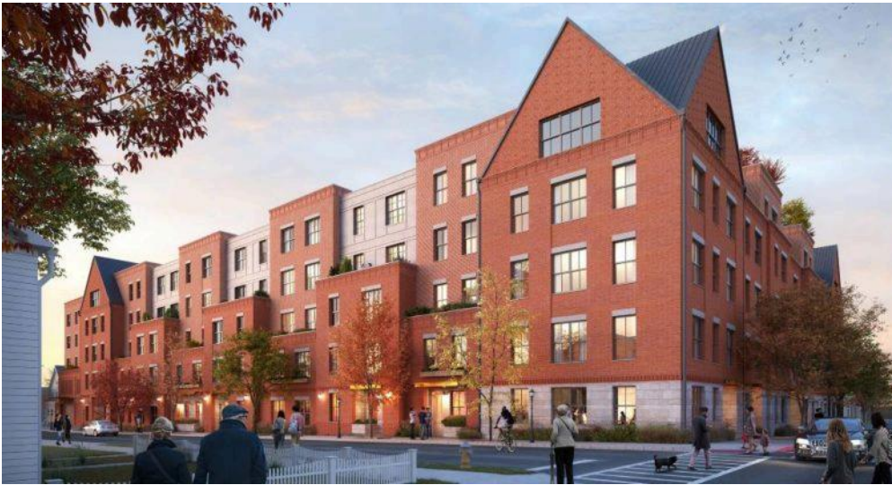
Rendering of Pelham House

BY: SEBASTIAN MORRIS 7:00 AM ON JULY 10, 2022