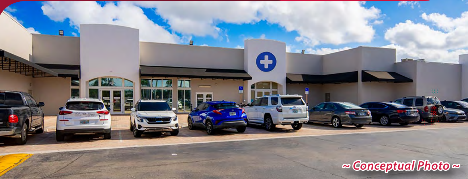
~ Conceptual Photo ~

Prime opportunity to develop a Class A medical or retail facility in one of Cape Coral's growing corridors. This site offers flexibility for a wide range of users seeking a custom-built space tailored to their operational needs.