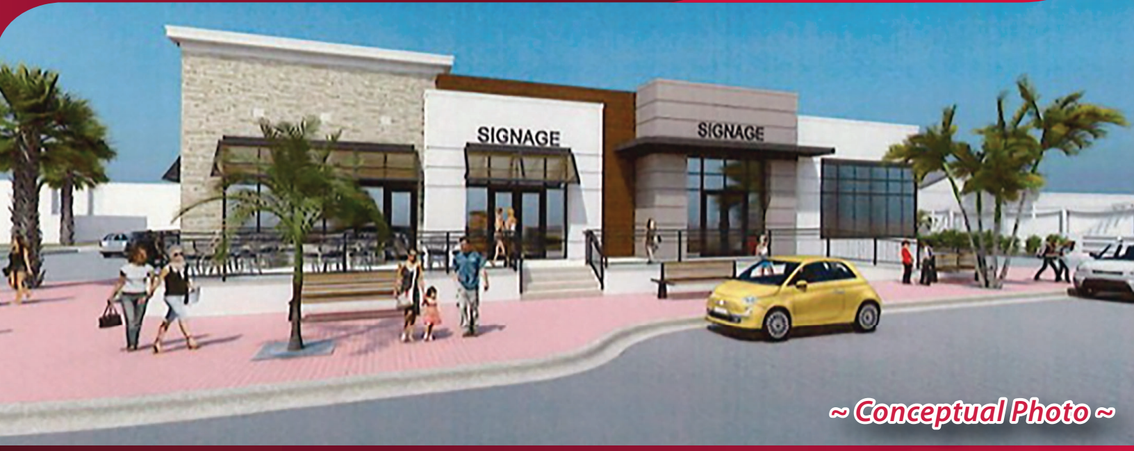
~ Conceptual Photo ~

4824 CAPE CORAL STREET, CAPE CORAL, FLORIDA 33904