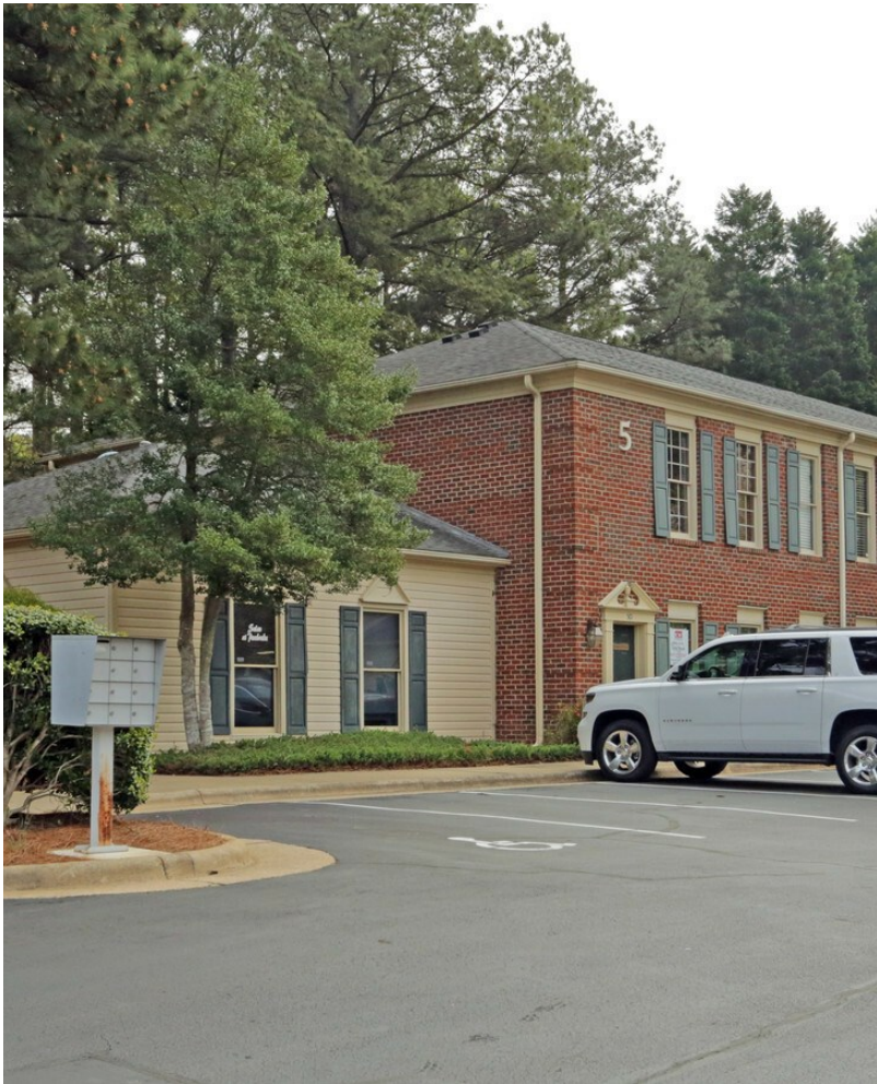
Bldg 5 $23.86 /SF/YR