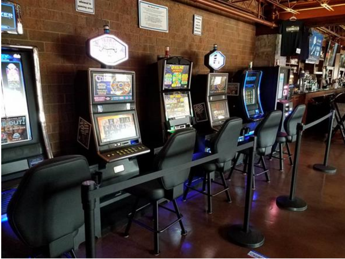
Upstairs Fusion Lounge