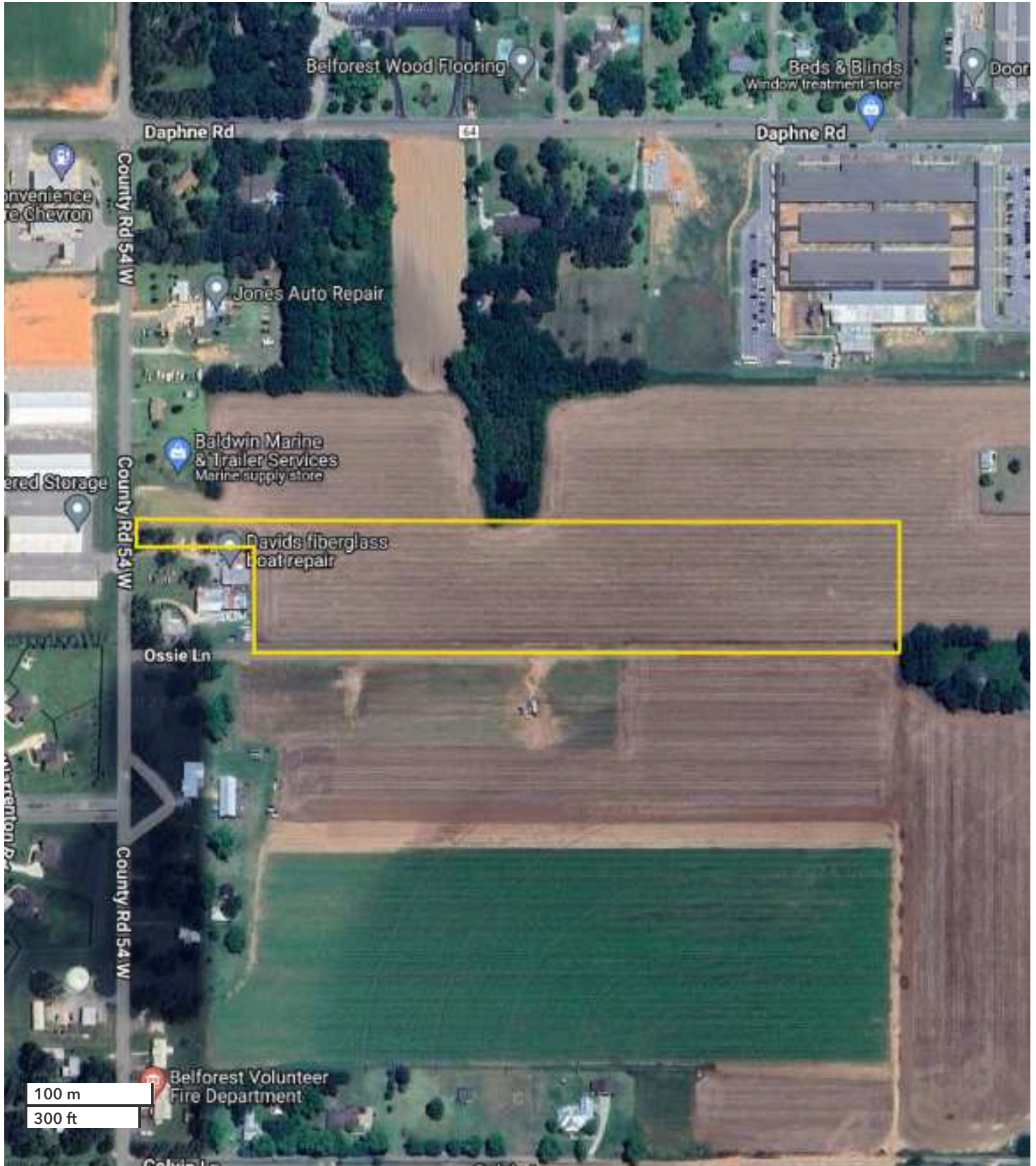
All boundary lines noted in pictures, aerials or maps should be considered estimates and not relied on as legal documents or descriptions.