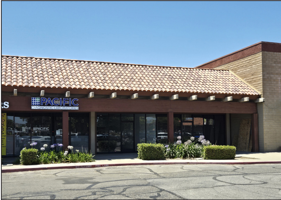
1313-M North H St.