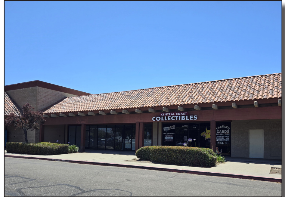
1321-A North H St.