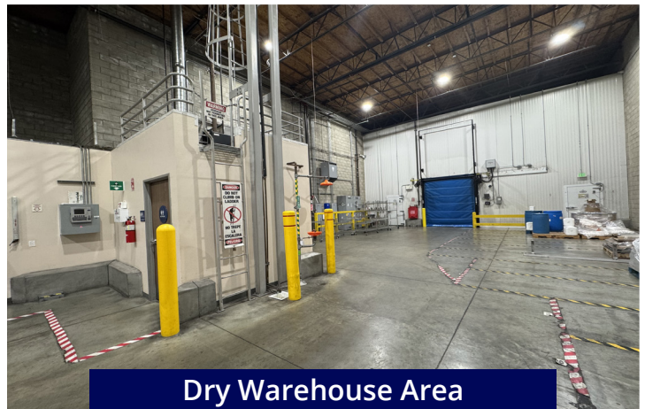
Dry Warehouse Area