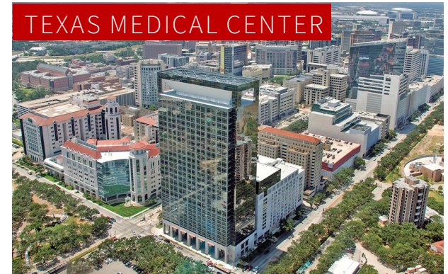
TEXAS MEDICAL CENTER