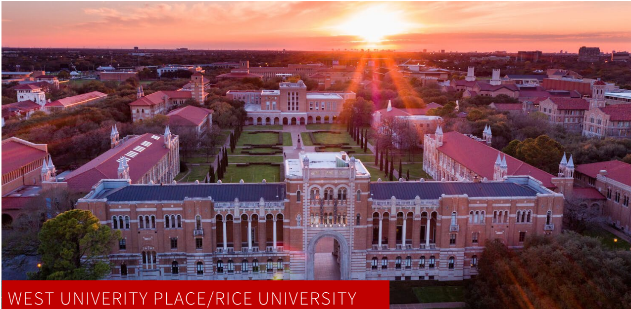
WEST UNIVERSITY PLACE/RICE UNIVERSITY