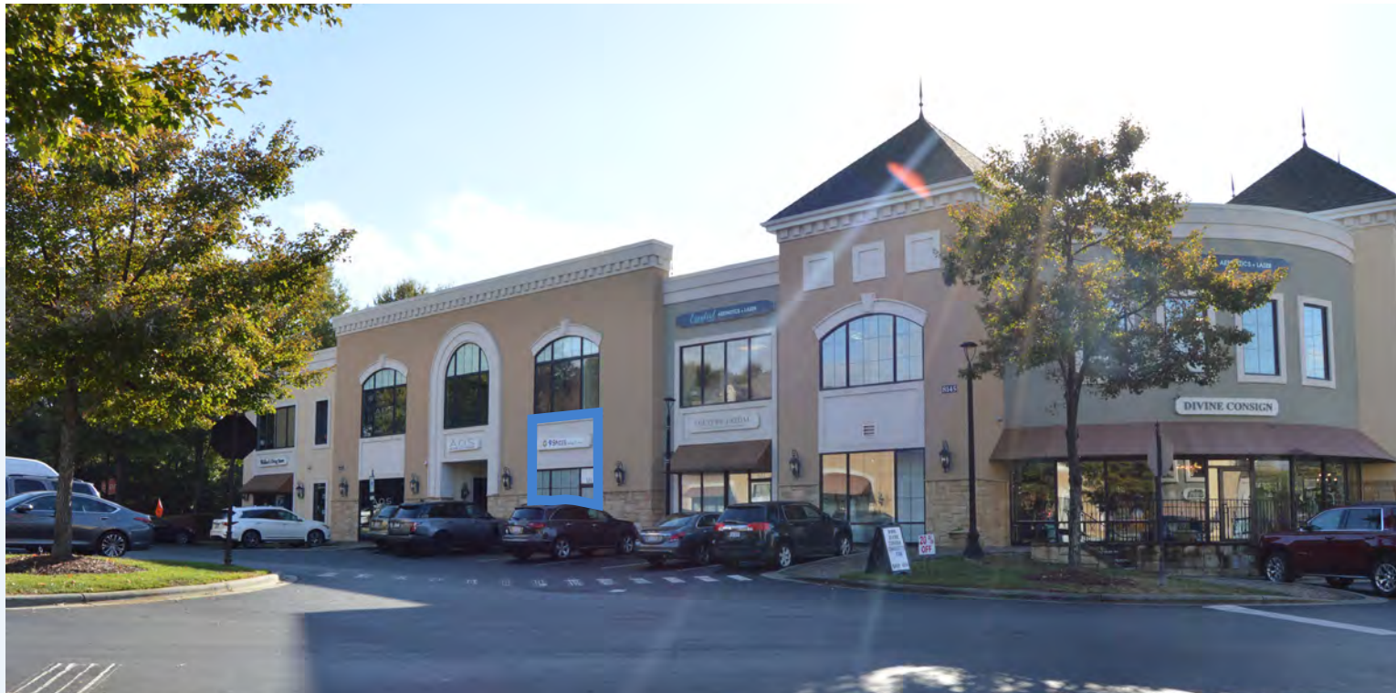
BACK ENTRANCE OF BUILDING H.