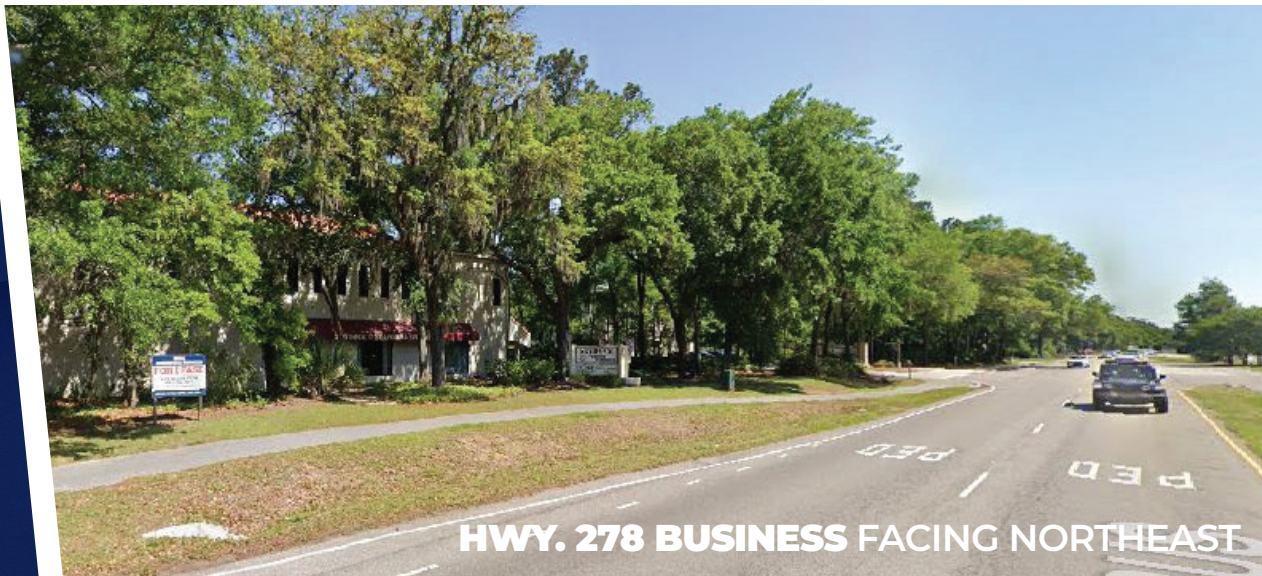
HWY. 278 BUSINESS FACING NORTHEAST