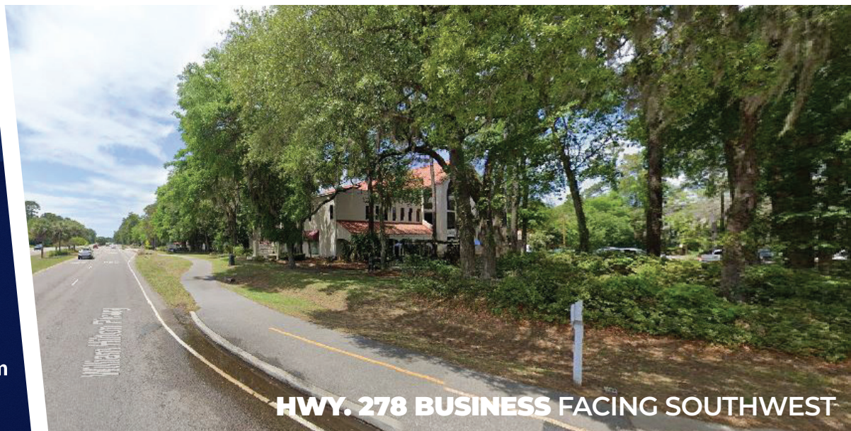
HWY. 278 BUSINESS FACING SOUTHWEST