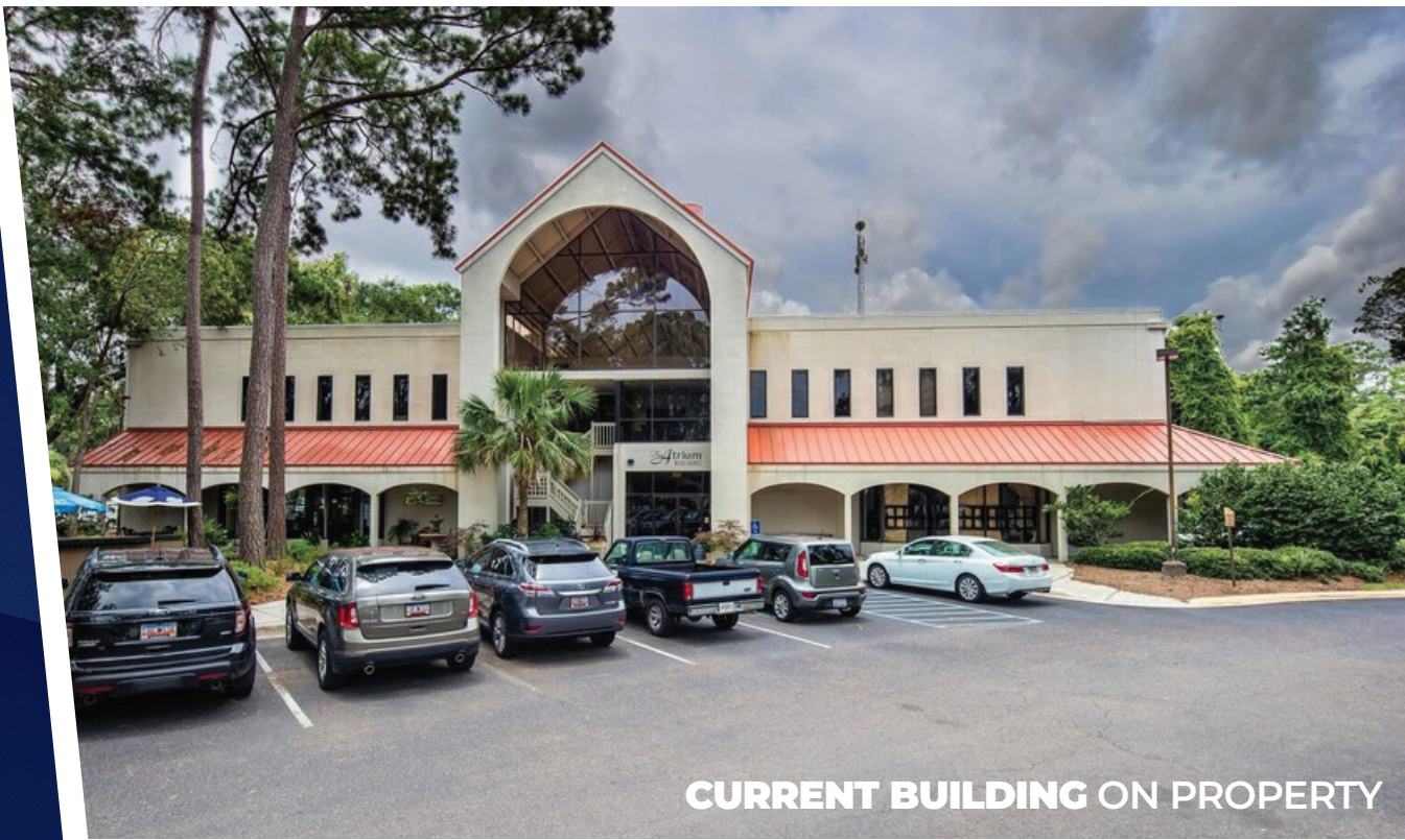
CURRENT BUILDING ON PROPERTY