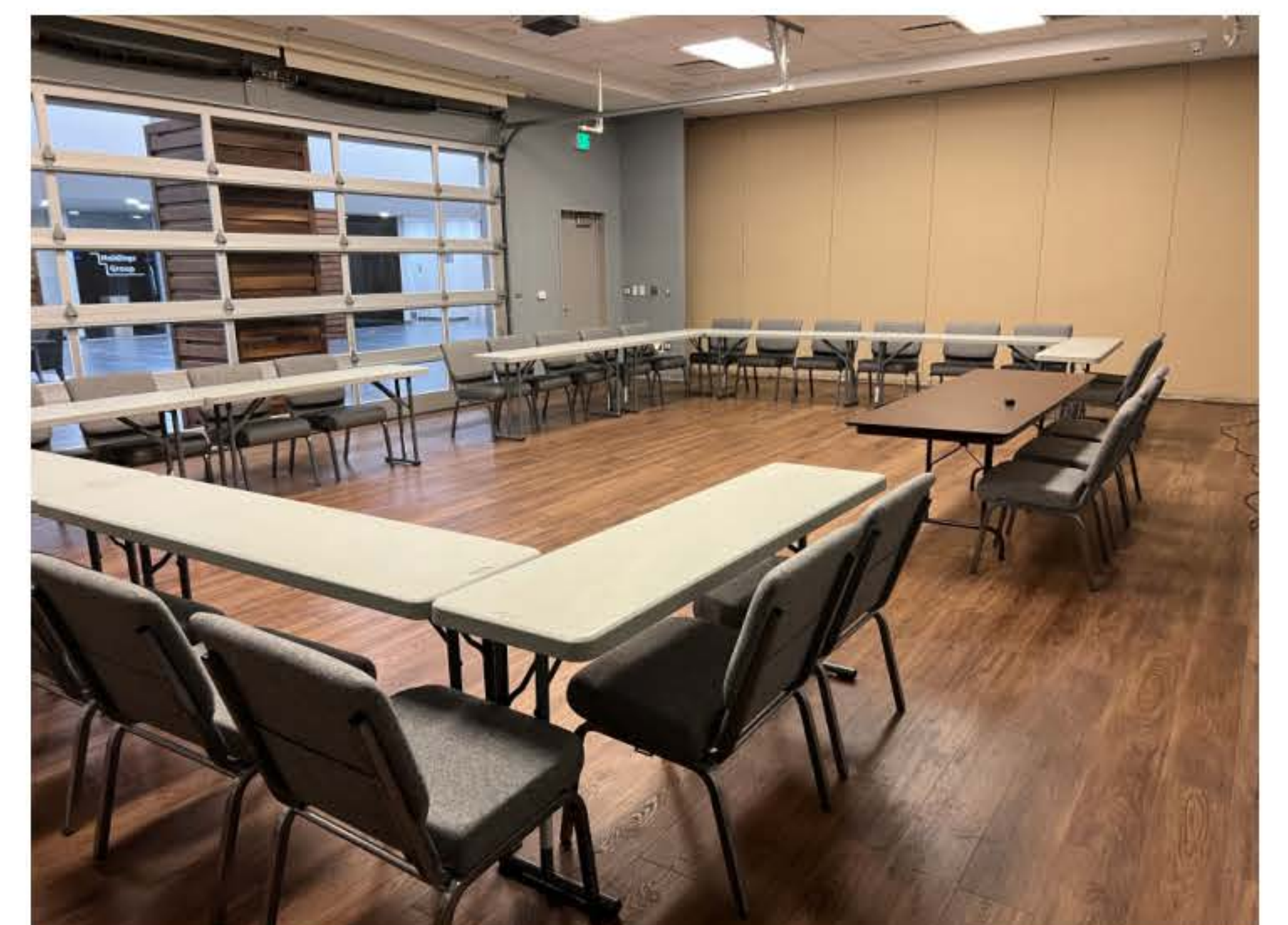
Atrium Conference Room: 30 Person Setup