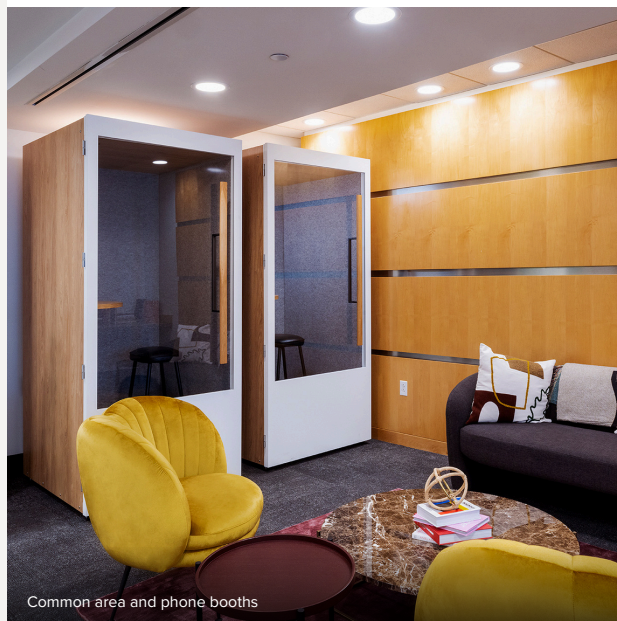
Common area and phone booths