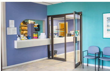
GROUND FLOOR MEDICAL