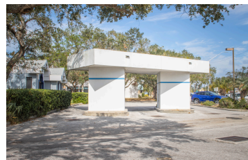
DETACHED DRIVE-THRU ATM STRUCTURE