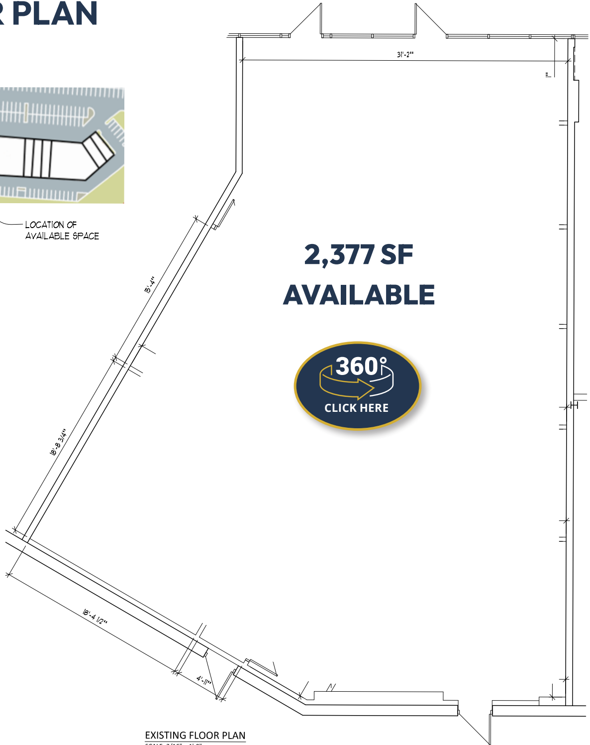
EXISTING FLOOR PLAN SCALE: 3/16" = 1'-0"