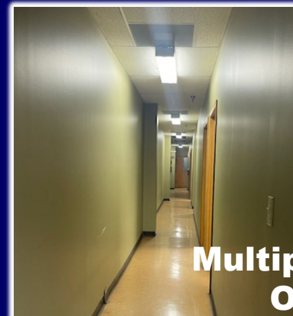
Multiple Private Offices