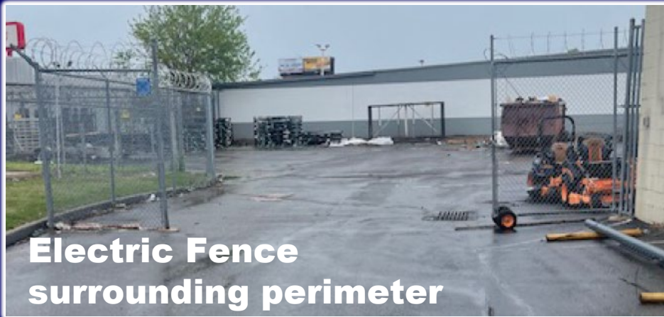
Electric Fence surrounding perimeter