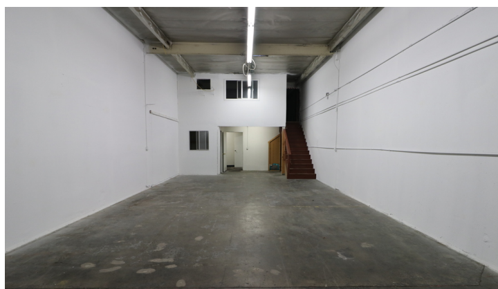
SAMPLE Unit Pictures