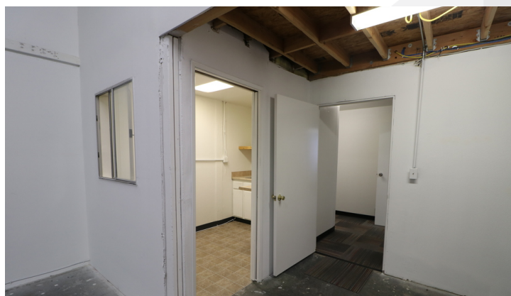
SAMPLE Unit Pictures