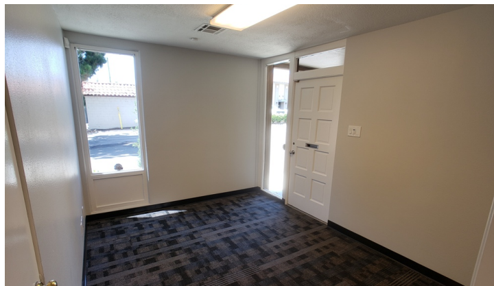
SAMPLE Unit Pictures