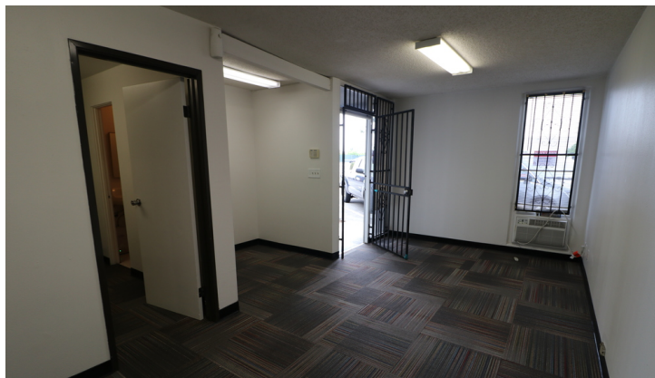
SAMPLE Unit Pictures