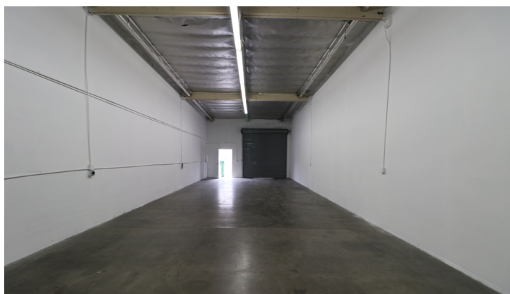
SAMPLE Unit Pictures