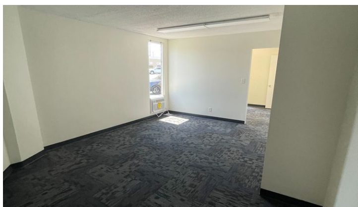
SAMPLE Unit Pictures