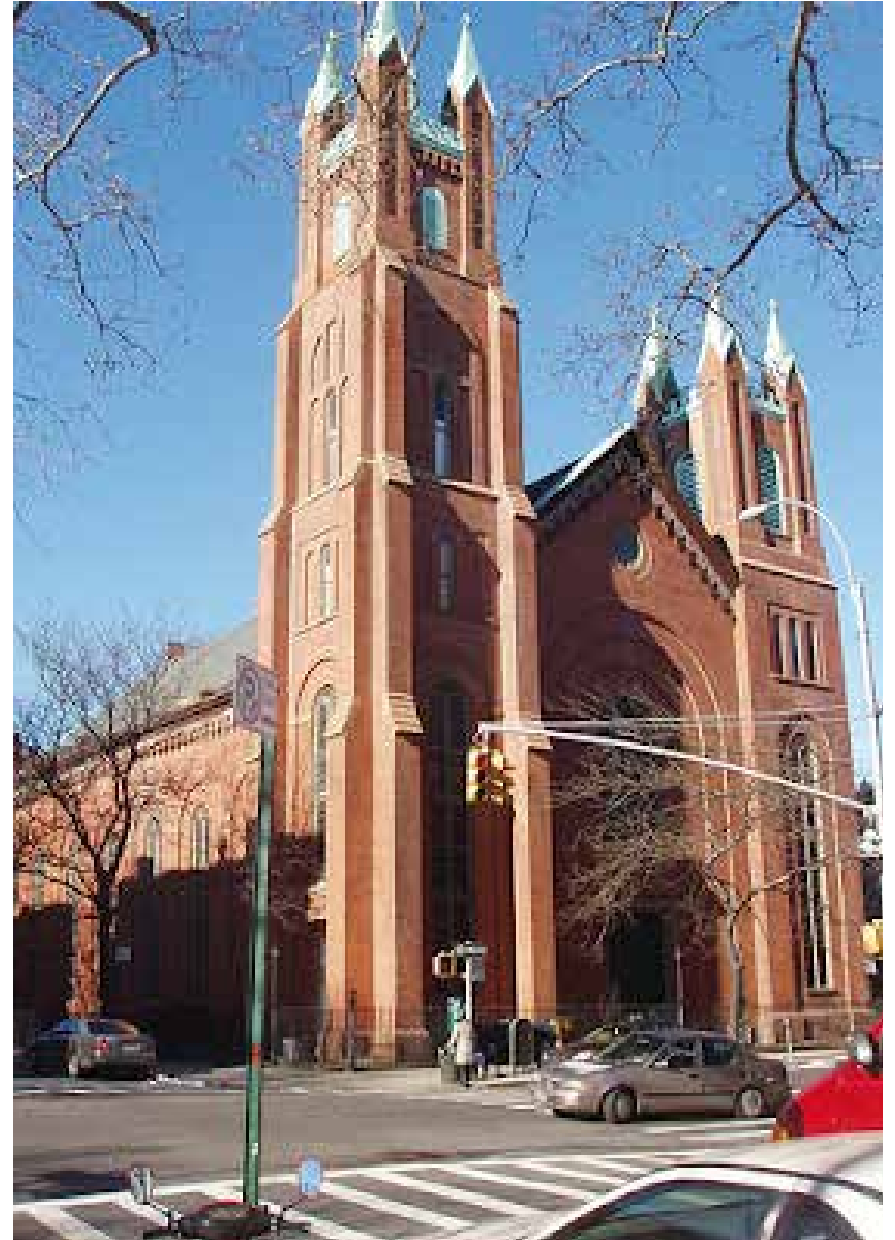
South Congressional Church Complex