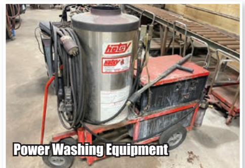
Power Washing Equipment