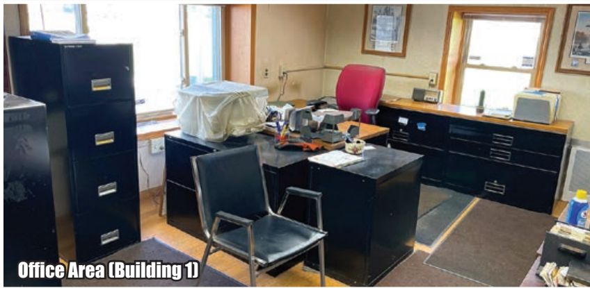
Office Area (Building 1)