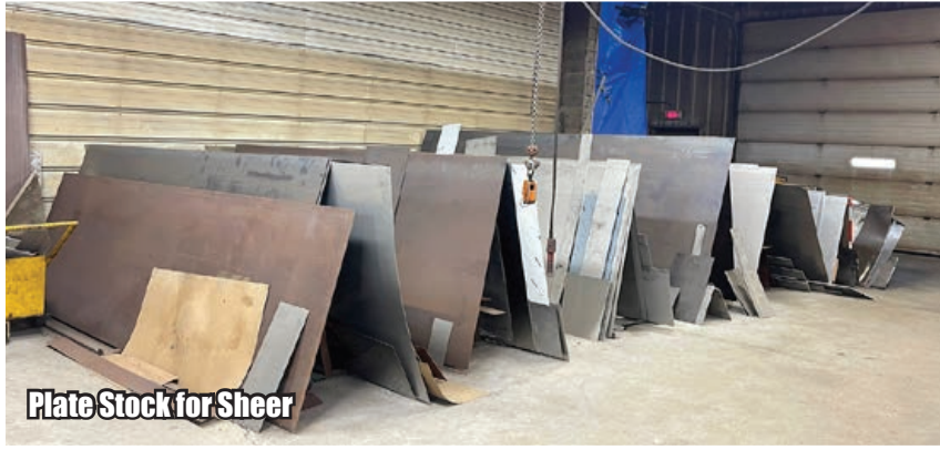
Plate Stock for Sheer