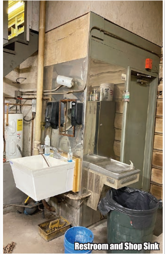
Restroom and Shop Sink