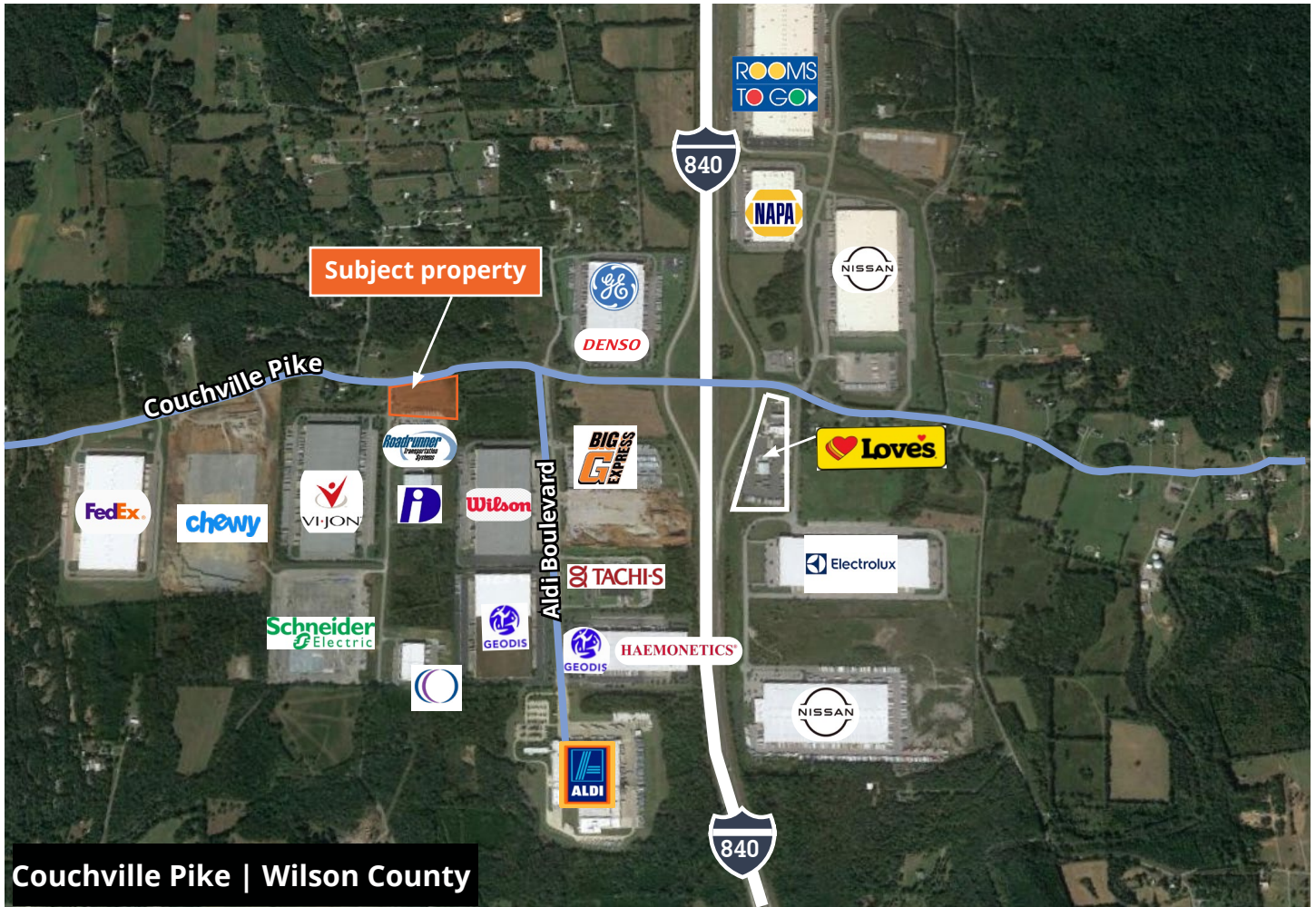
Couchville Pike | Wilson County