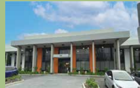
BR Metro Office - Medical