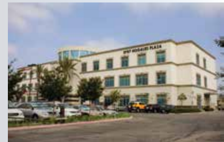
Nogales Plaza - Medical