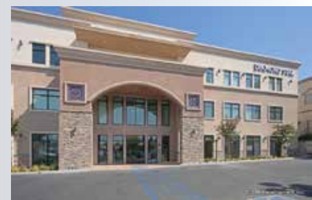
Diamond Star - Medical