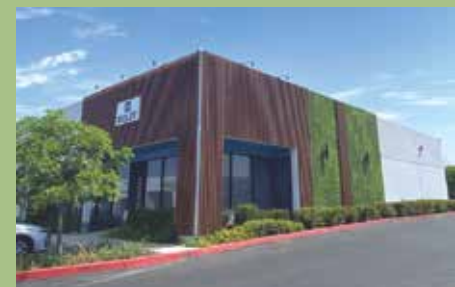
Brea Canyon Business Park - Industrial