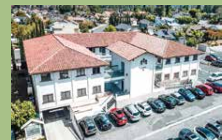
Laguna Hills Medical Art Building