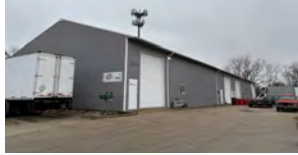
29820-29830 N. SKOKIE HWY