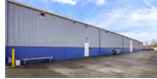
29850 N. SKOKIE HWY