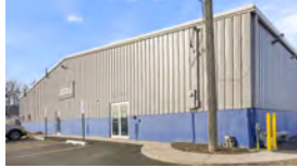
29800 N. SKOKIE HWY