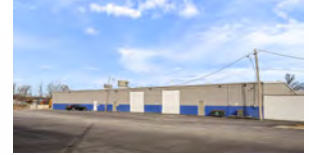
29860 N. SKOKIE HWY