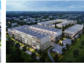
EDISON PARK 80 TOWNHOMES