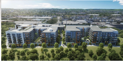
MODERA NATIONS 396 APARTMENTS