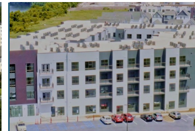
SILO WEST 169 APARTMENTS