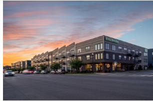
BEXLEY SILO BEND 193 APARTMENTS