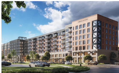
CAMDEN NATIONS 400 APARTMENTS