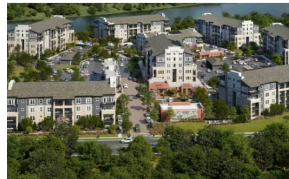
LIVANO NATIONS 319 APARTMENTS