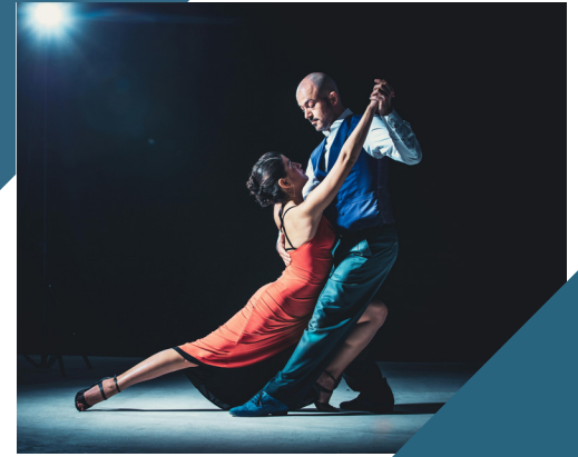
THE ART OF BALLROOM