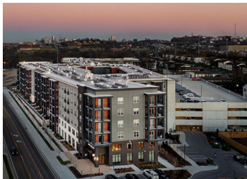
CORTLAND AT THE NATIONS 342 APARTMENTS