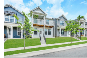
49 | TN RESIDENCES 55 TOWNHOMES