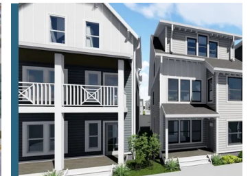
SILO PARK 49 TOWNHOMES