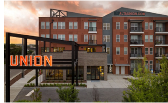
ALTA UNION 283 APARTMENTS