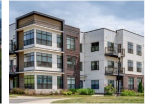
SILO HOUSE 103 CONDOS