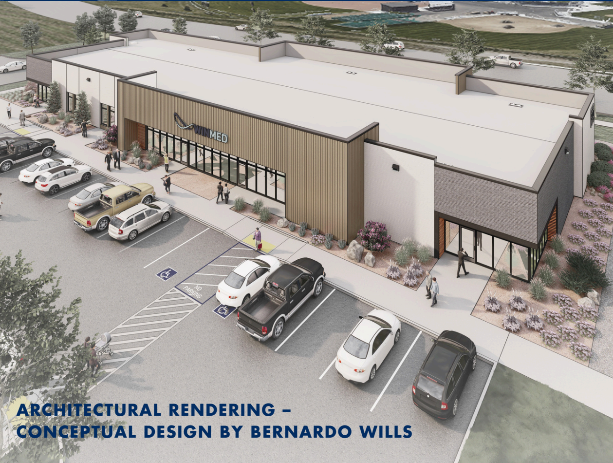
ARCHITECTURAL RENDERING – CONCEPTUAL DESIGN BY BERNARDO WILLS