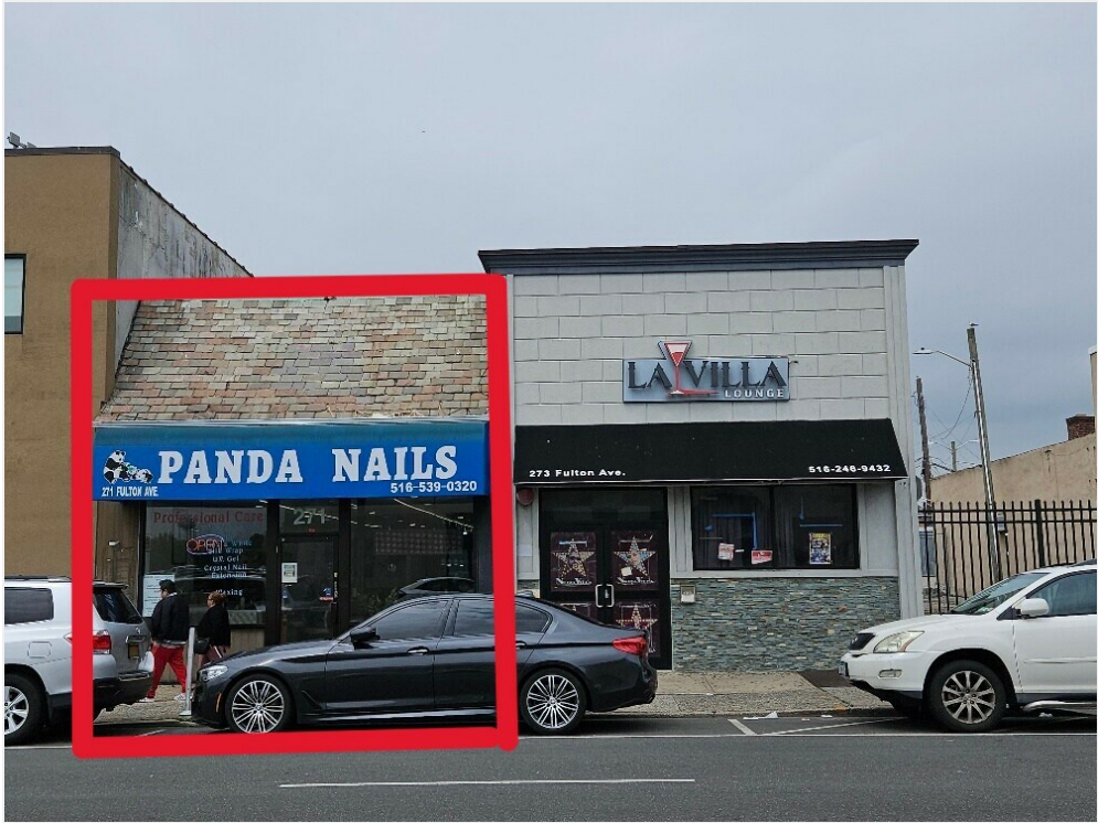
271 Red Border