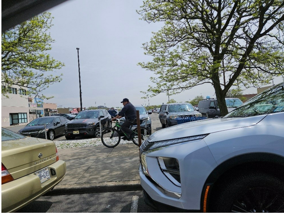
FREE Municipal Parking 1