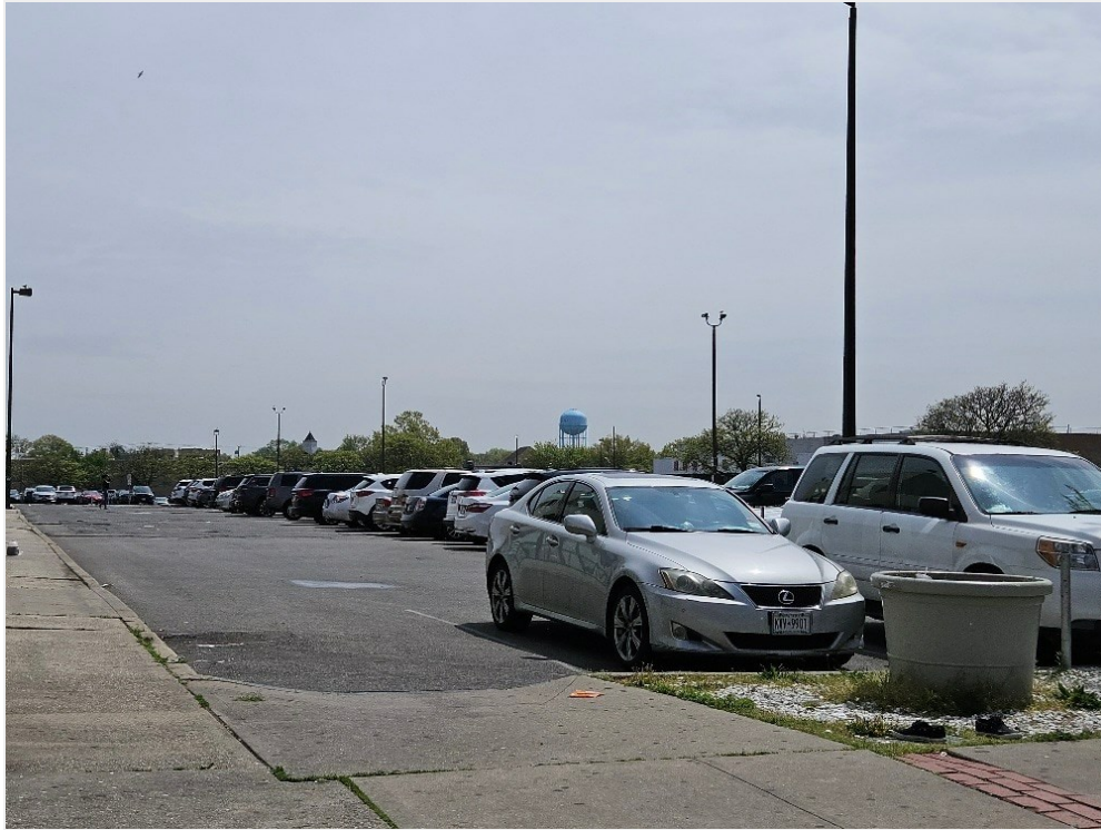
FREE Municipal Parking 1 2 3