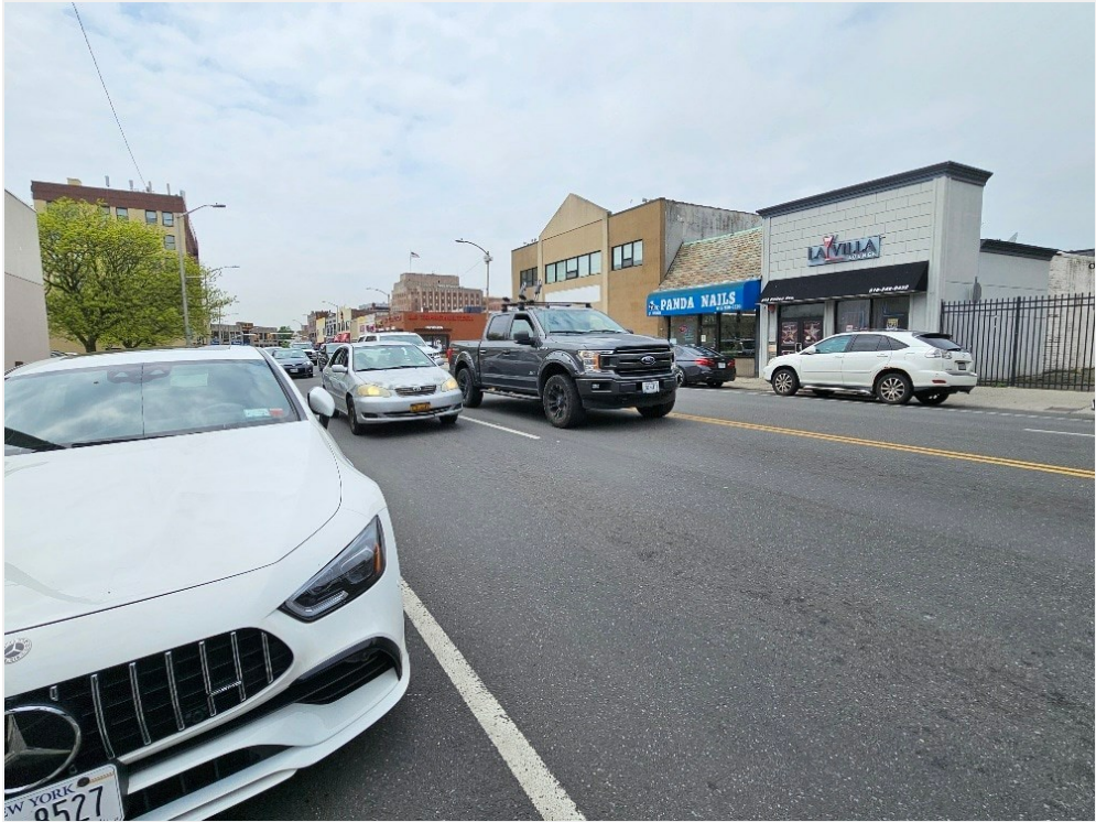
Elevation Angle 2