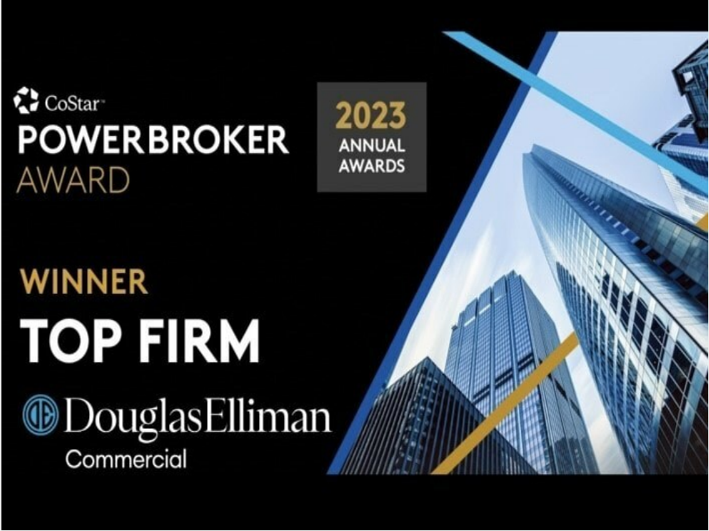
power broker social post