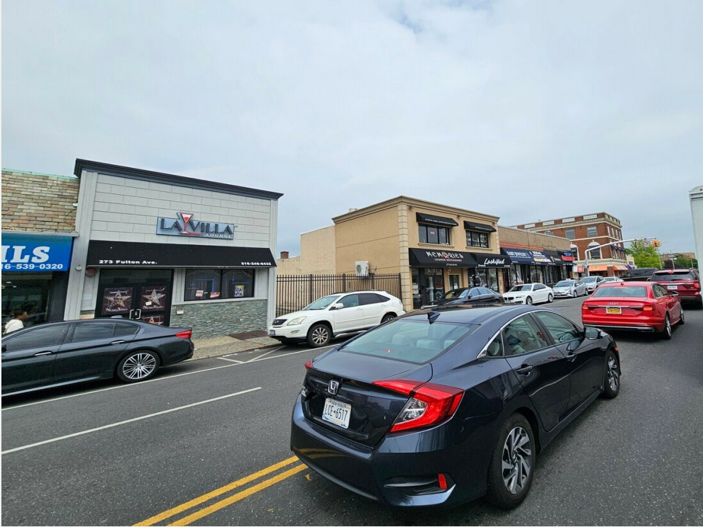
Elevation Angle 1