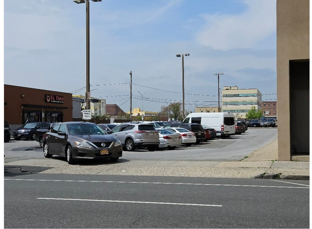
FREE Municipal Parking 1 2