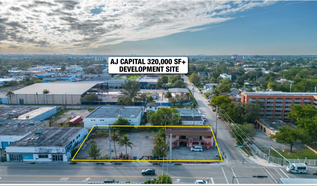
7424 + 7488 NE 2ND AVE - MIAMI, FL 33138