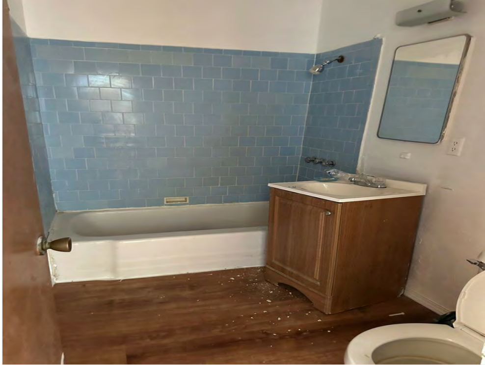
Residential Unit 4 - Bathroom