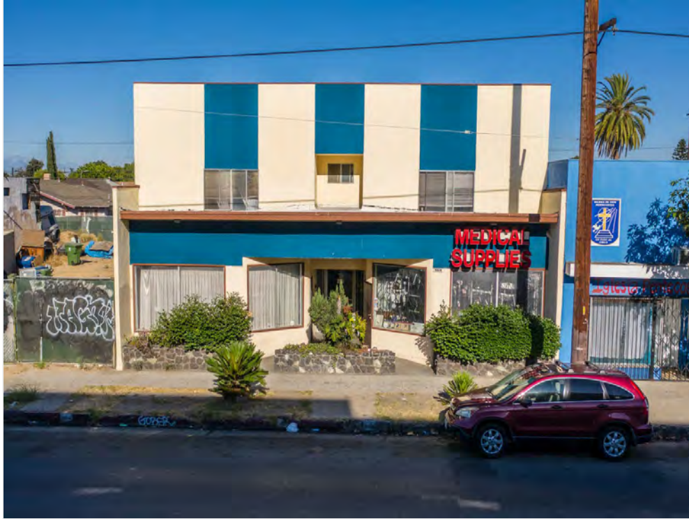
4614 S Western Ave