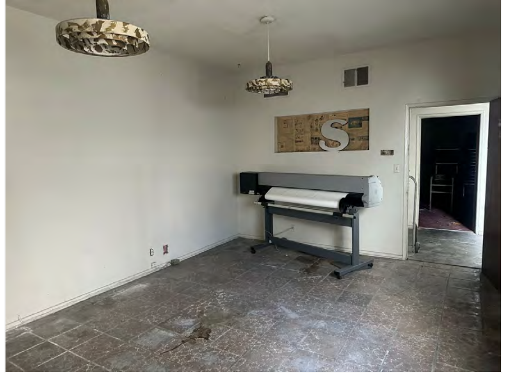
Commercial Unit B