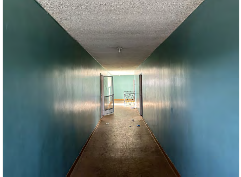
2nd Floor Interior Hallway