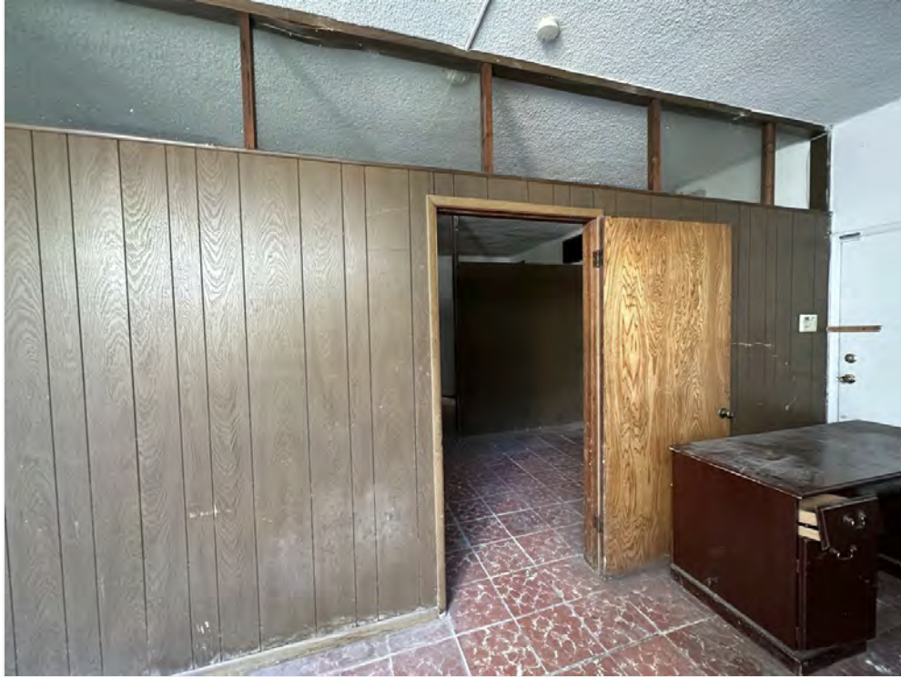
Commercial Unit 1st Floor