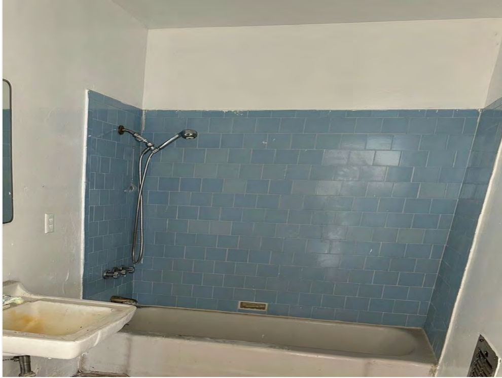
Residential Unit 2 - bathroom