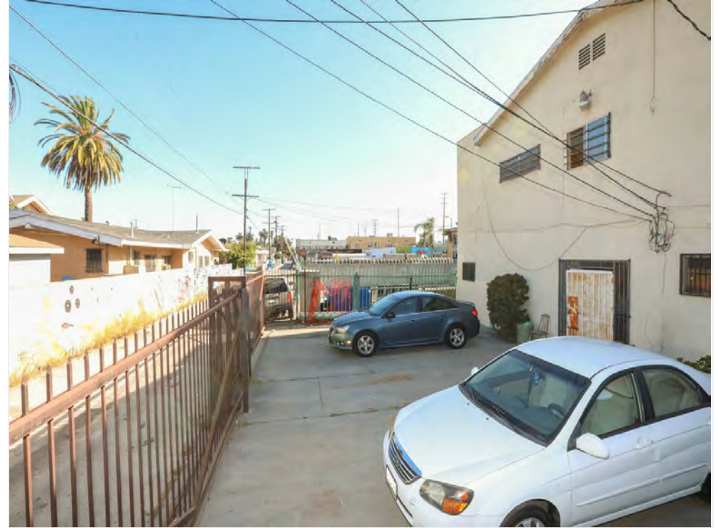
Rear Parking Lot