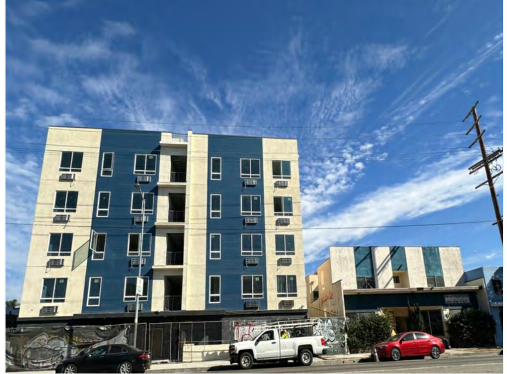
2024 Front Exterior, New Construction to North