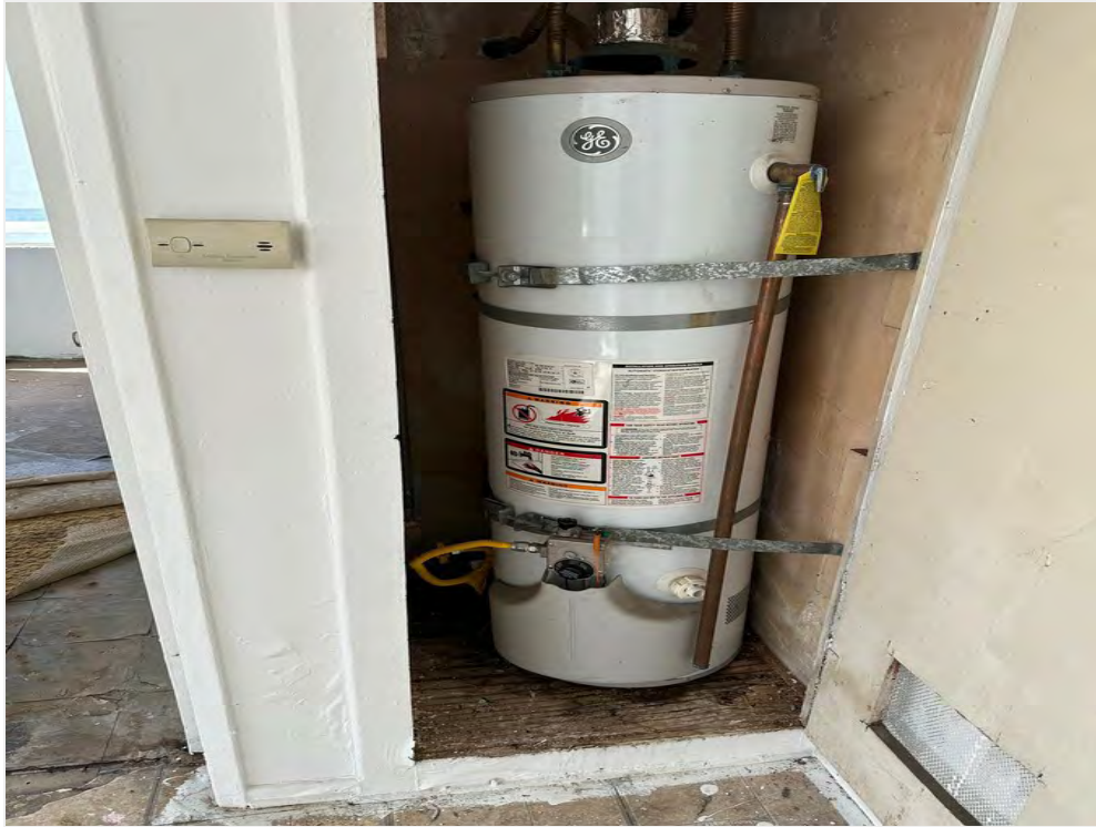
Residential Unit 2 - Hot Water Heater