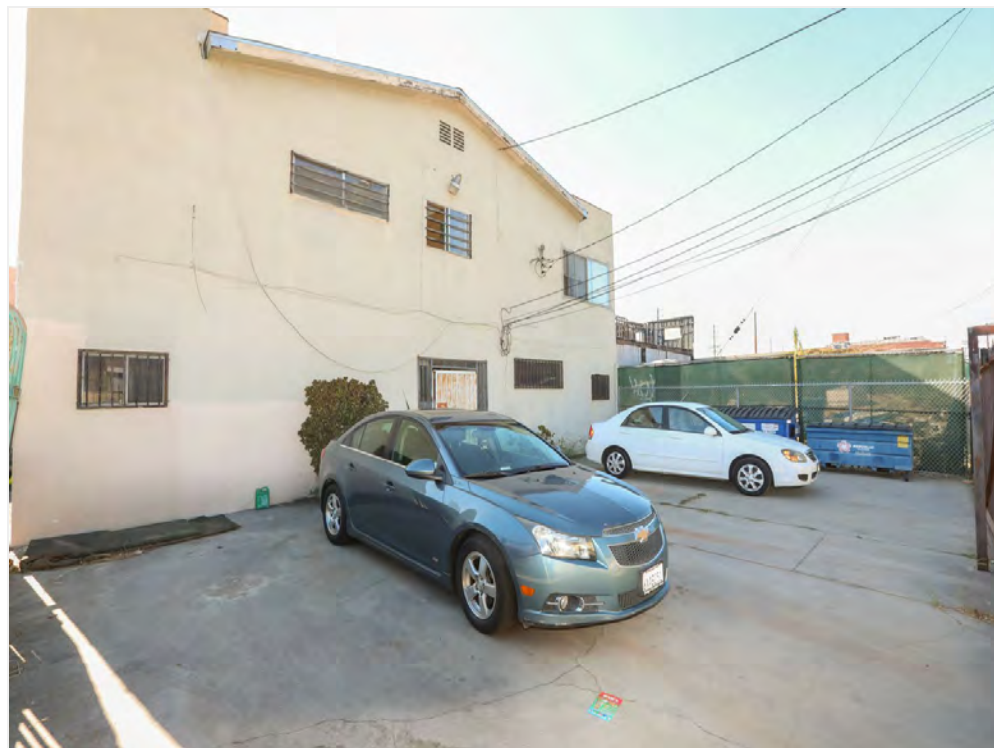
Gated Parking Lot