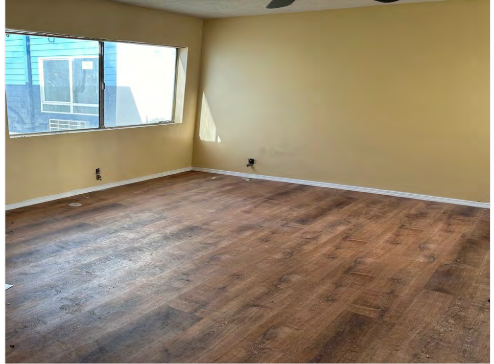
Residential Unit 4 - living room