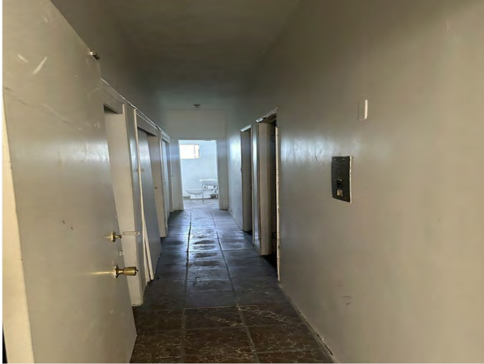
1st Floor Interior Hallway