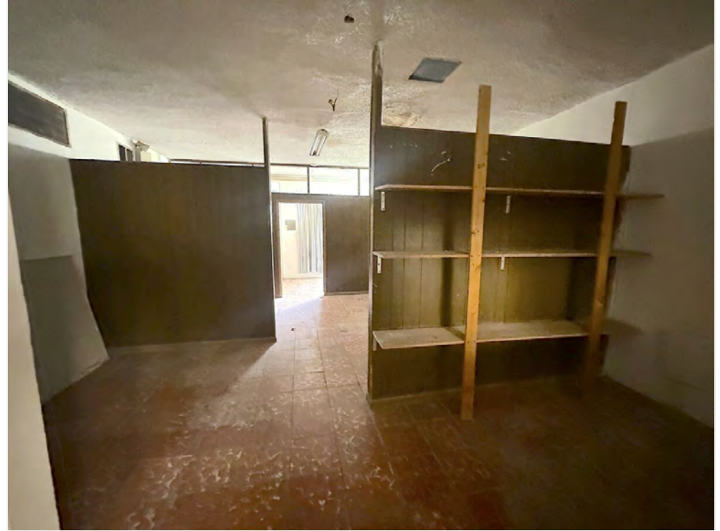
Commercial Unit A