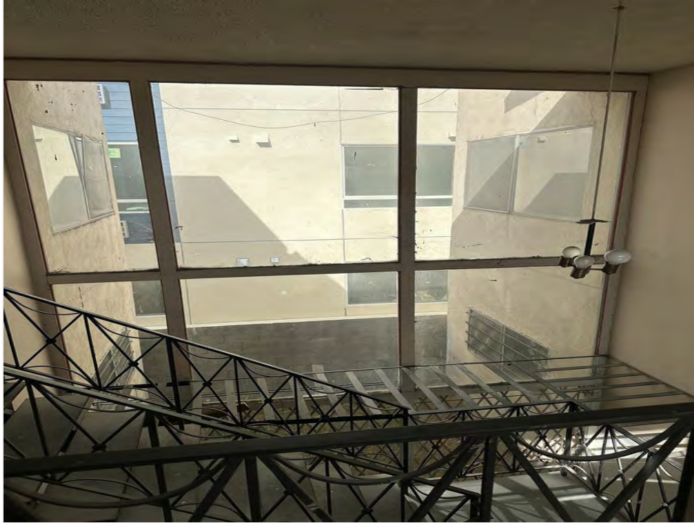
Staircase and Large Glass Windows