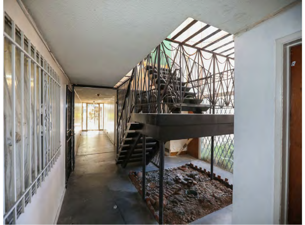
1st Floor hallway and staircase