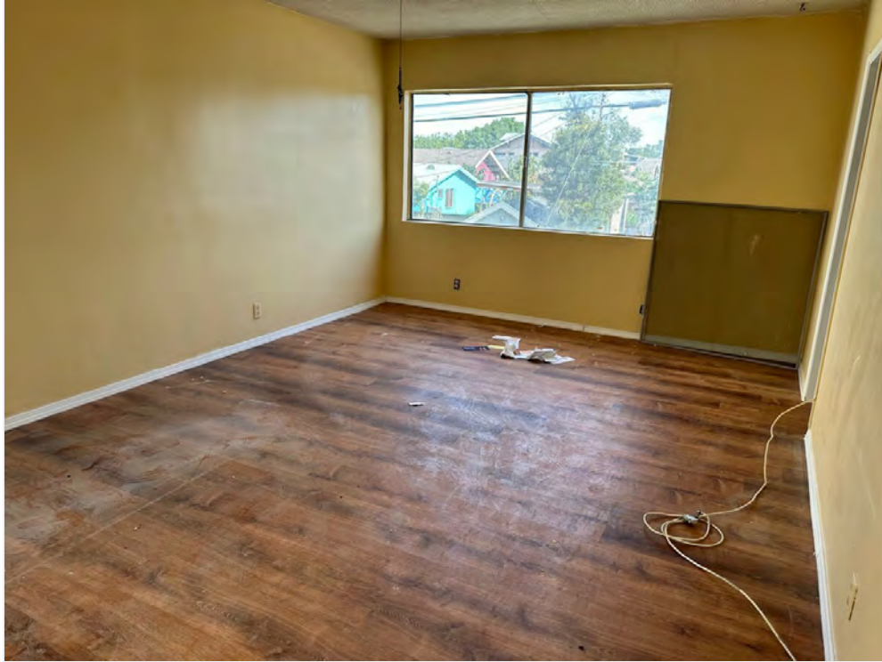
Residential Unit 4 - Bedroom