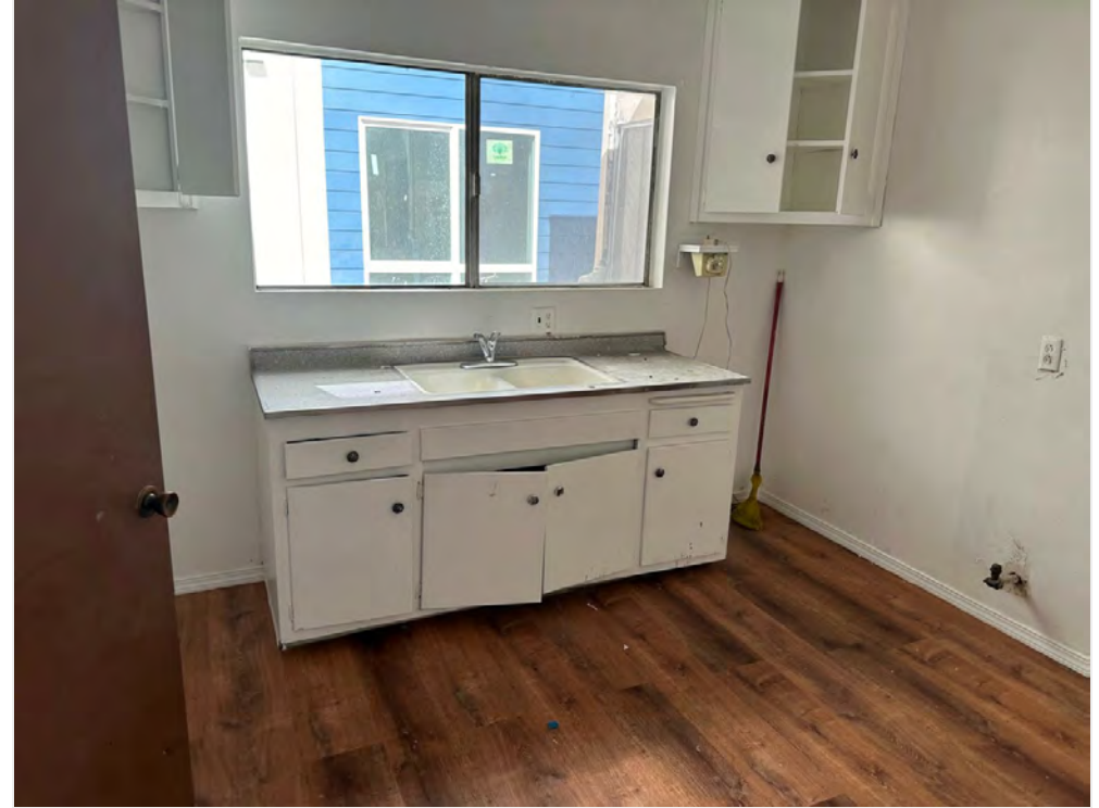
Residential Unit 4 - Kitchen