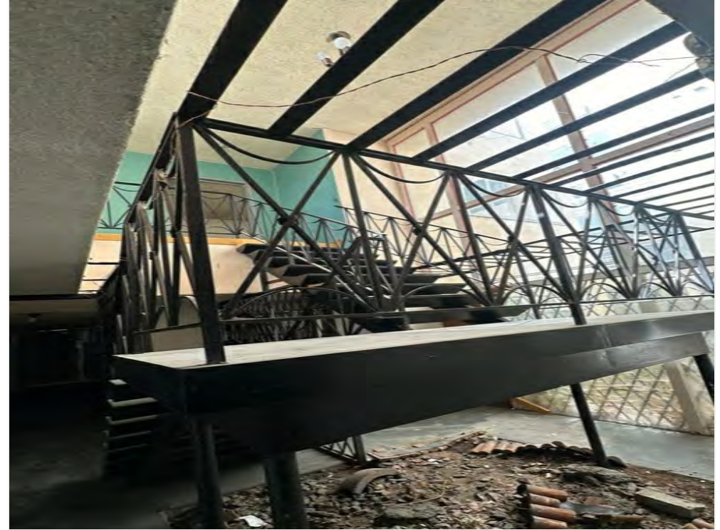
Staircase from 1st floor