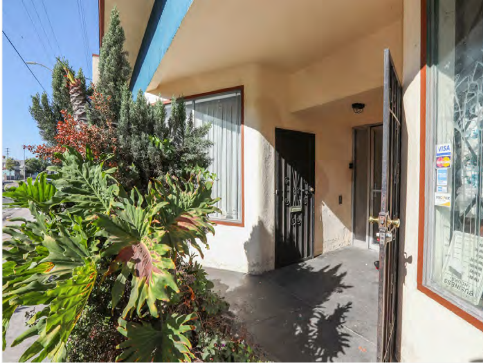
4614 S Western Ave