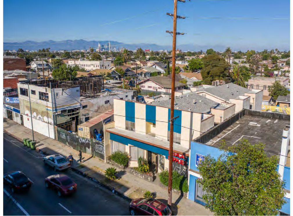
4614 S Western Ave