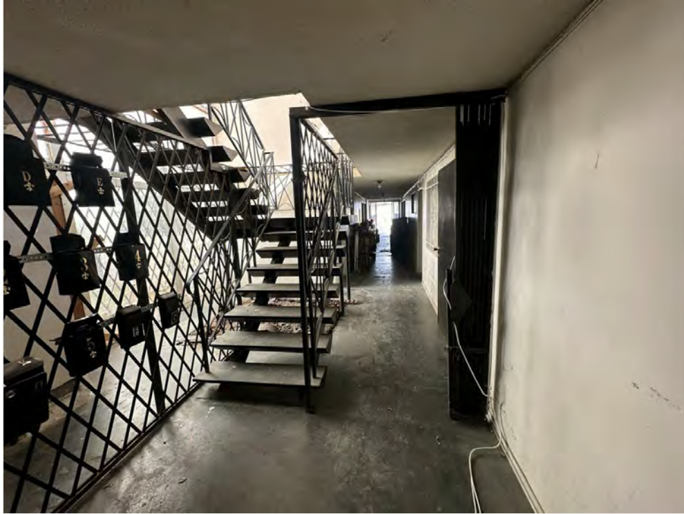
1st Floor Main Hallway and Staircases