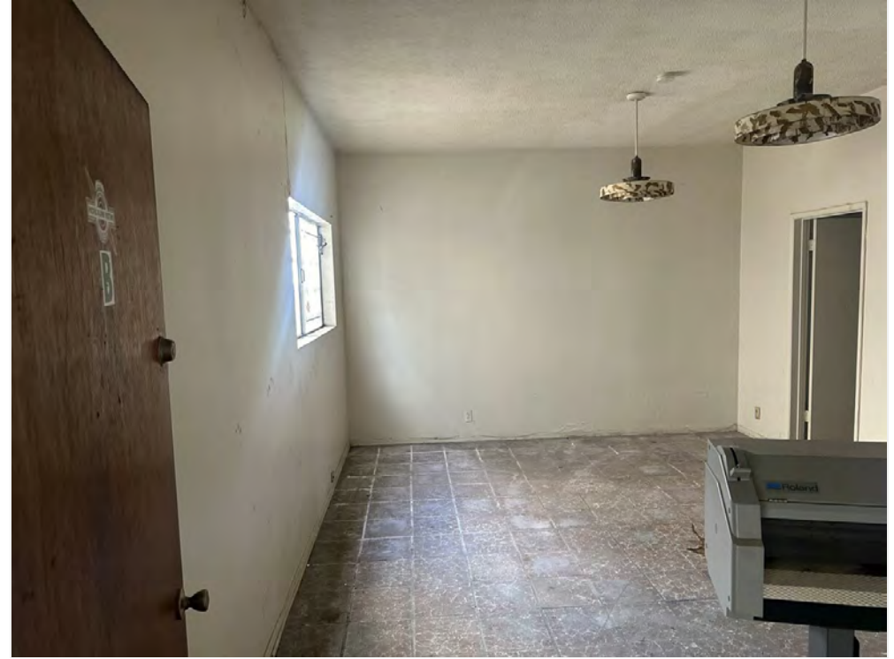
Commercial Unit B