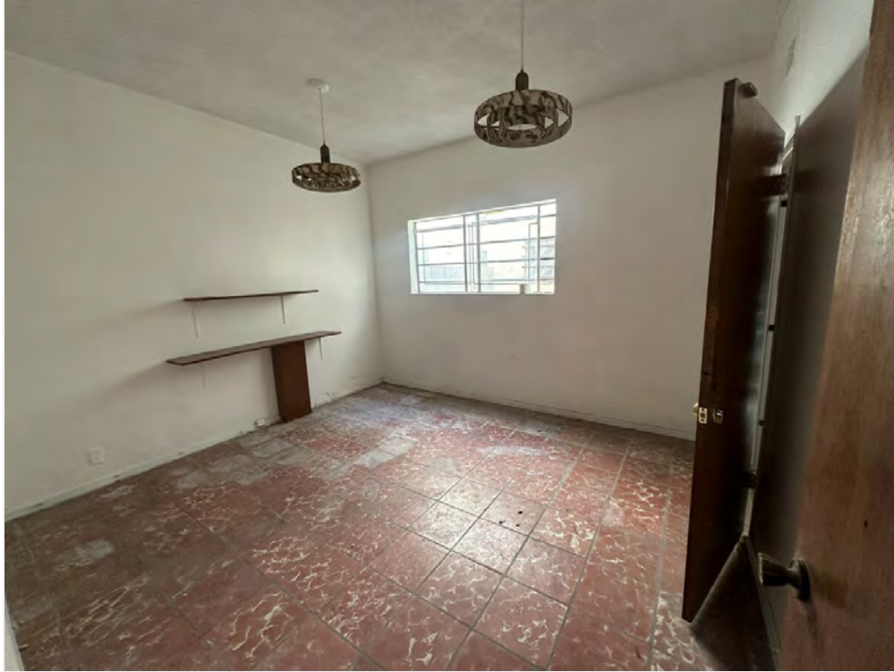
Commercial Unit 1st Floor