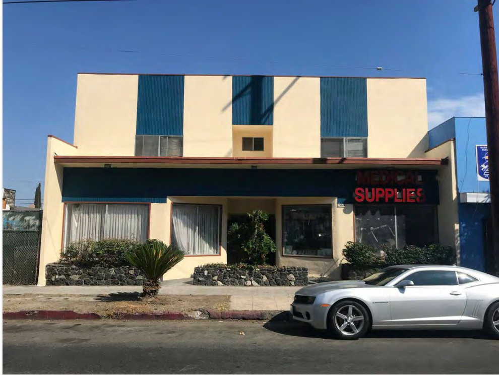
4614 S Western Ave