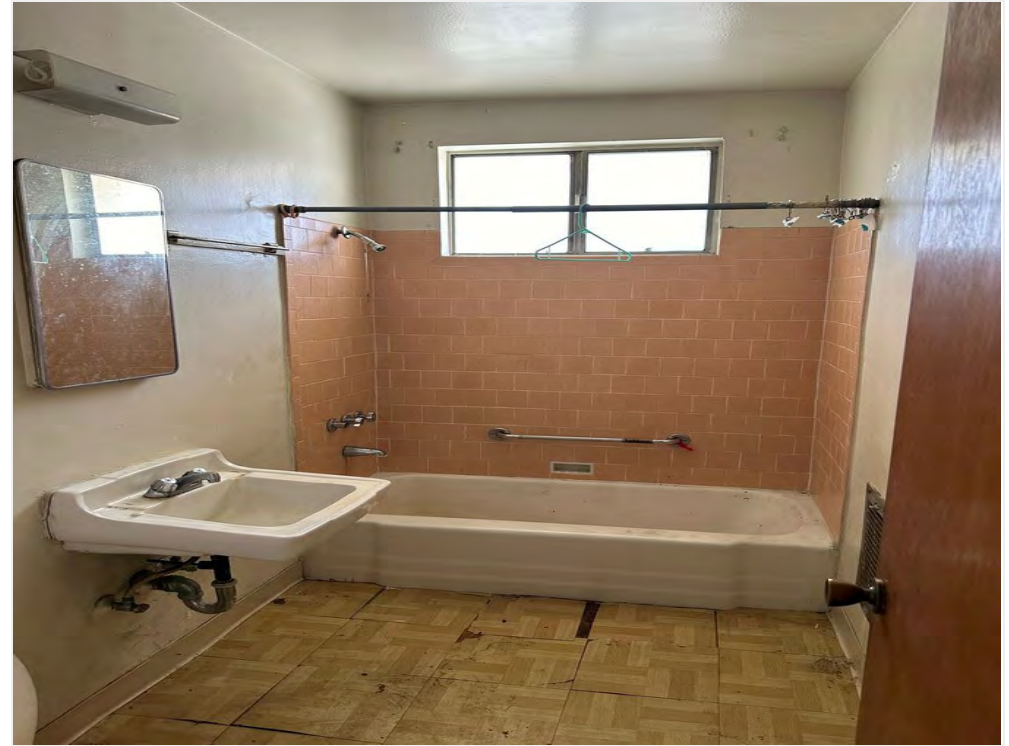
Residential Unit 1 - bathroom