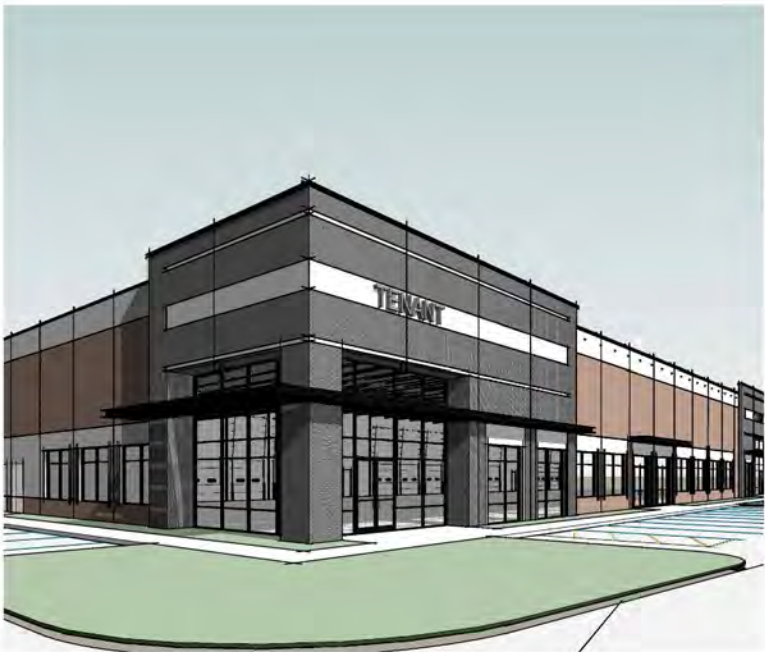
1 CORNER PERSPECTIVE