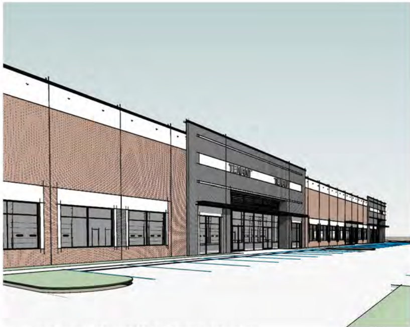
2 CENTER ENTRANCE PERSPECTIVE