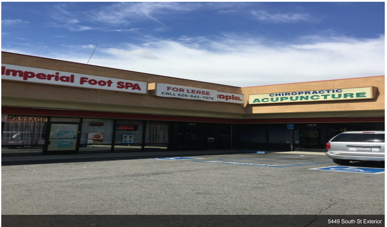
5449 South St Exterior