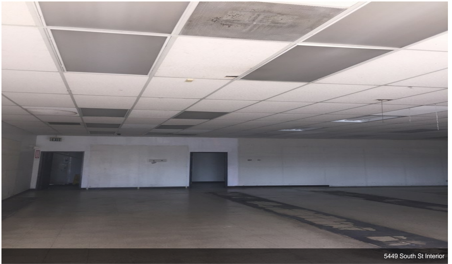
5449 South St Interior