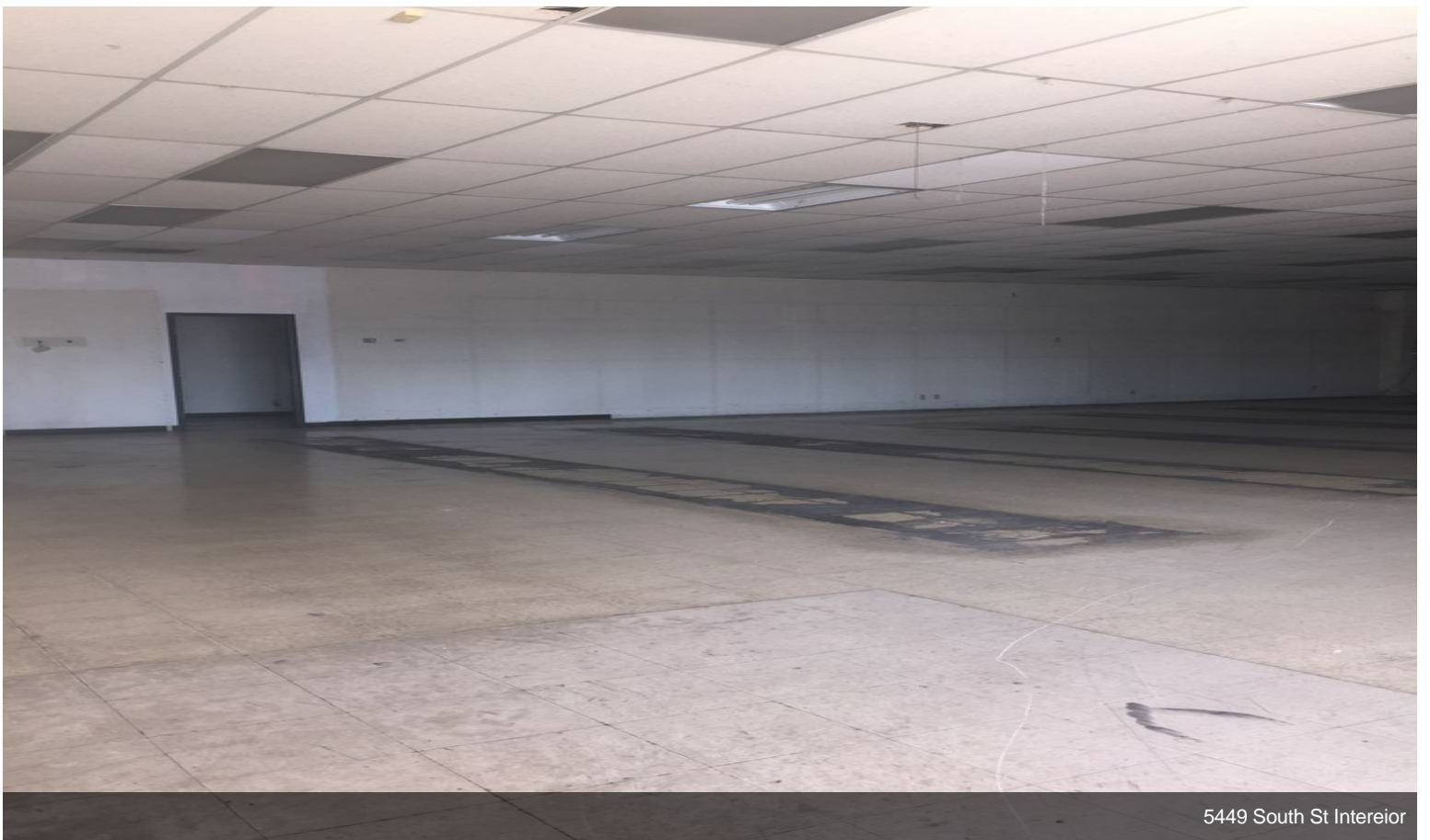
5449 South St Interior