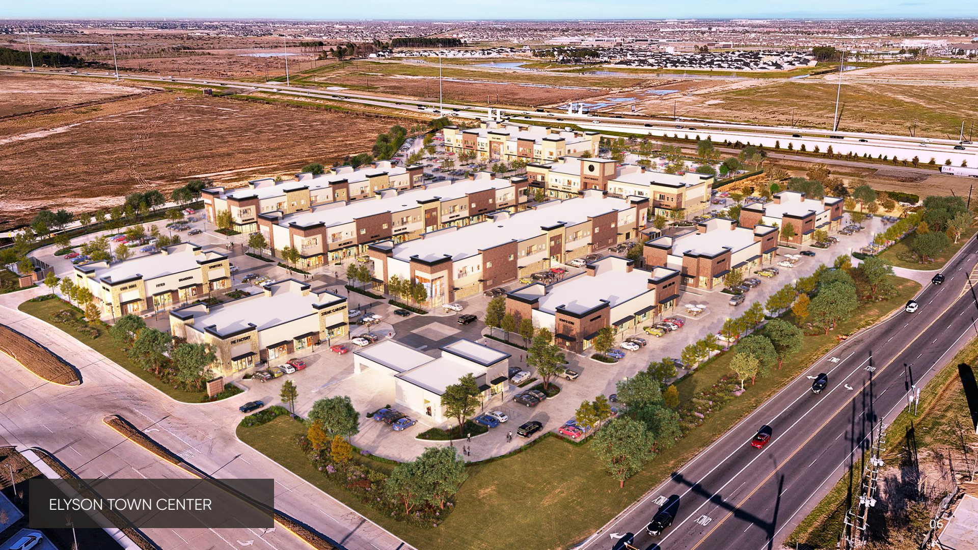
ELYSON TOWN CENTER