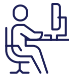
14 PRIVATE OFFICES