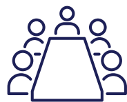
2 CONFERENCE ROOMS