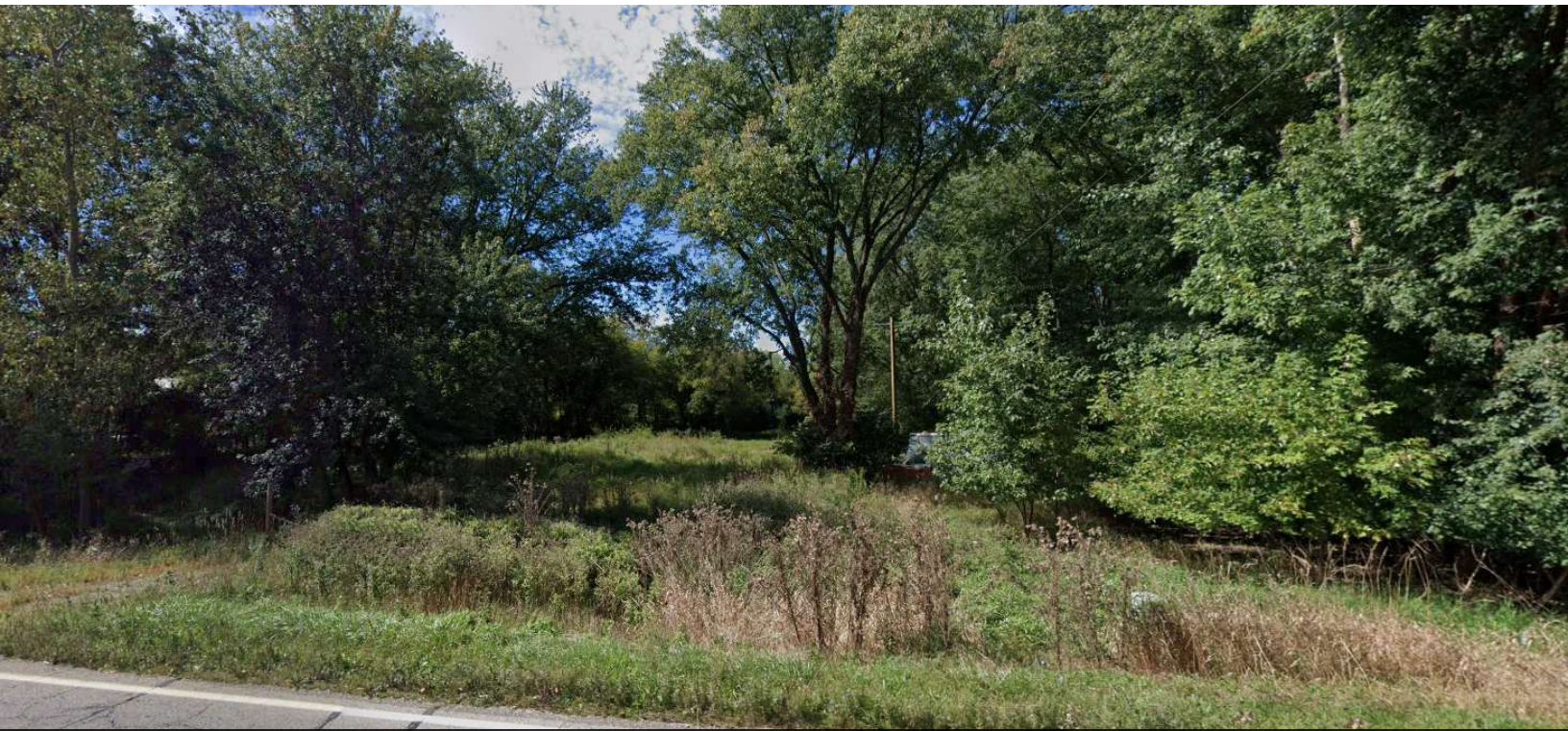
View from Chandler Rd