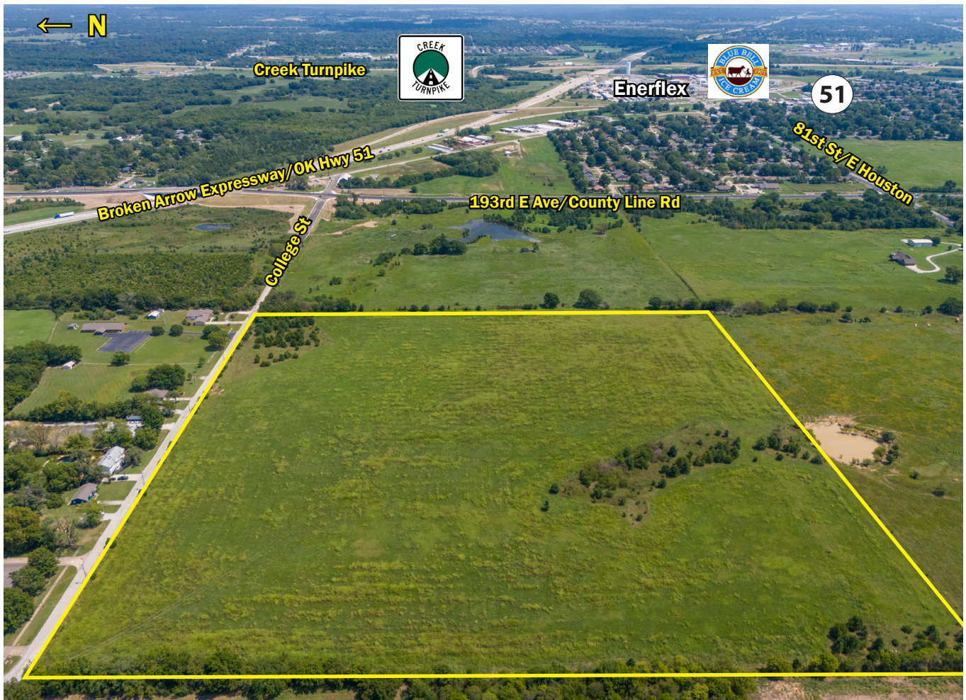
Approximate Property outline.