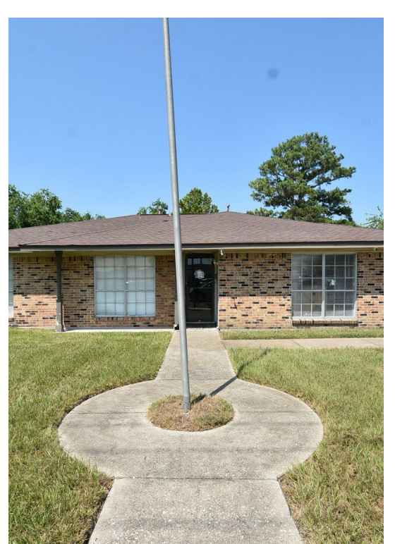
736 Wilson Rd