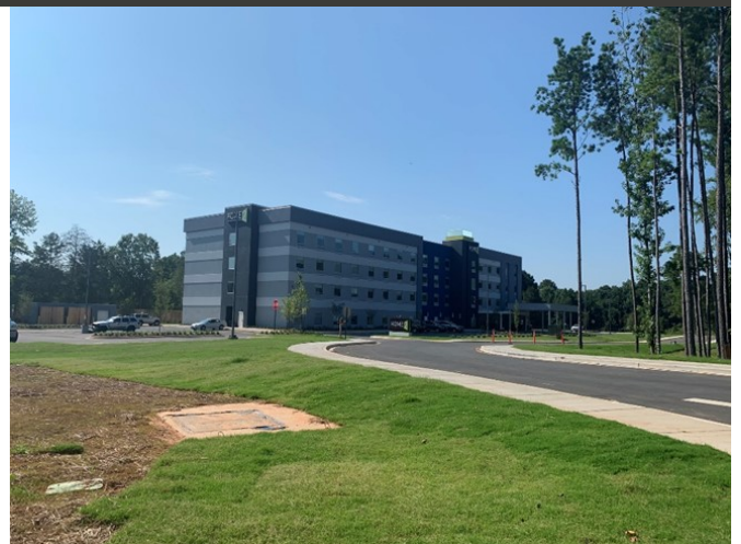
Home 2 Suites