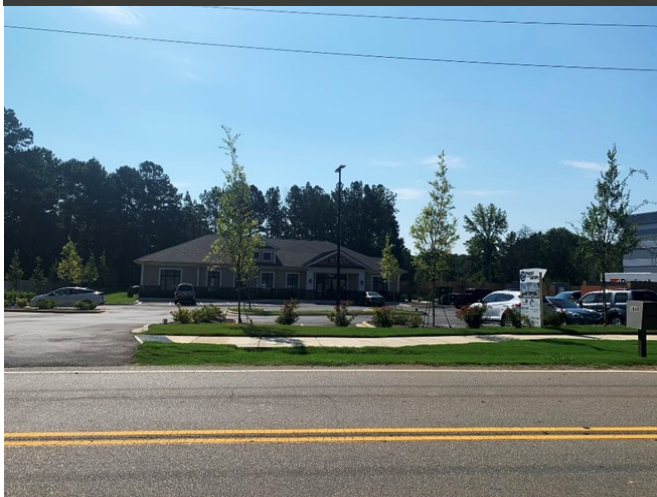
Prescott Family Dentistry