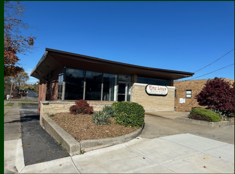
26101 Euclid Ave., Euclid, OH

No warranty or representation, express or implied, is made as to the accuracy of the information contained herein. It is submitted subject to errors, omissions, price changes, rental or other conditions, withdrawal without notice, and to any special listing conditions imposed by our client.