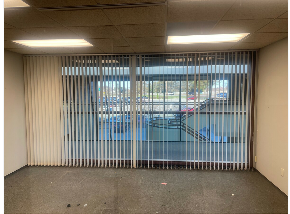
OWIC office 2