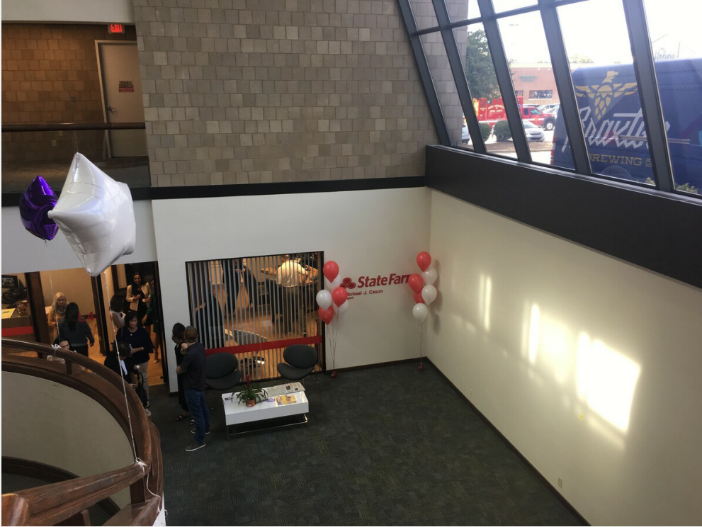
Lobby by State Farm