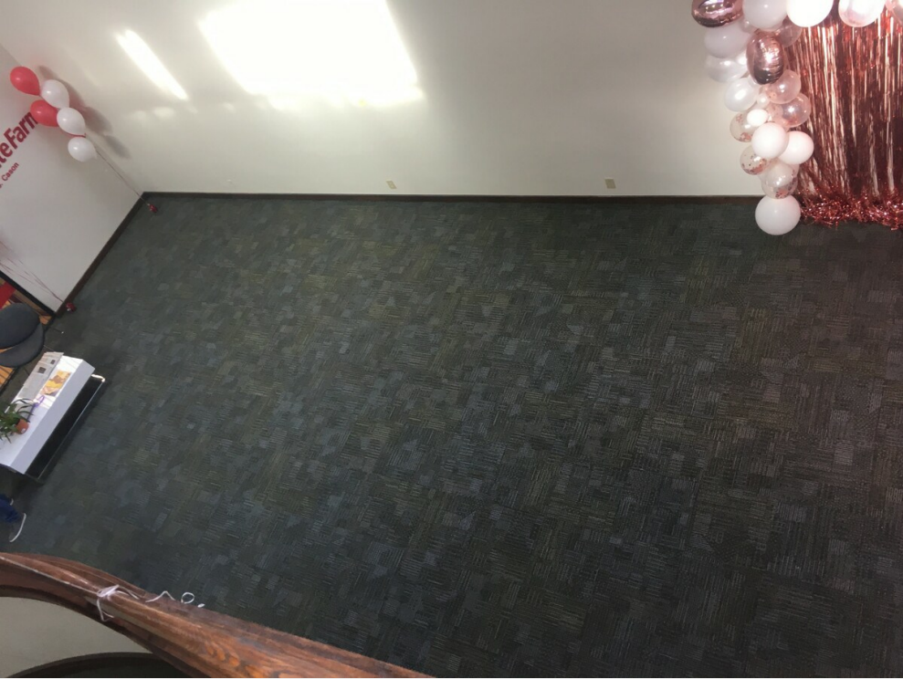
New Carpet in Lobby