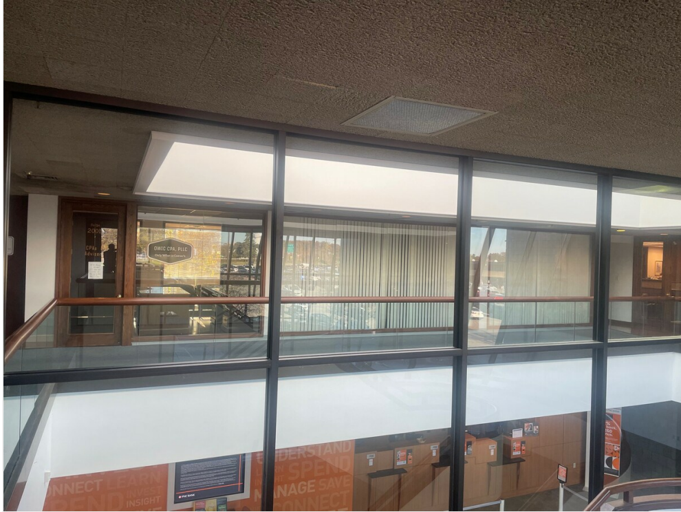
View of space from stairwell