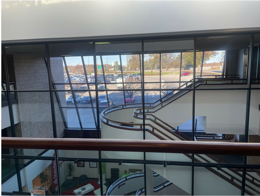
View from front 3 offices