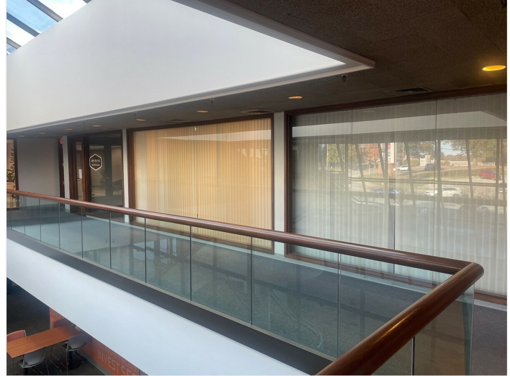
OWIC front 3 offices