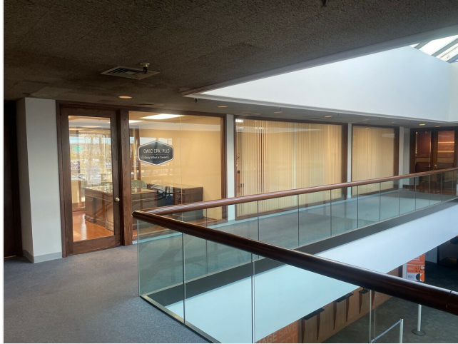
Former OWIC Entry