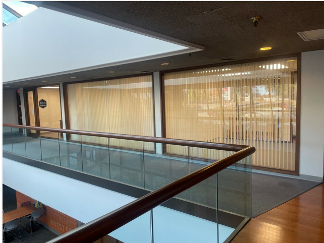
OWIC front 3 spaces