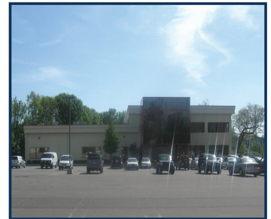
55 Old Gate Lane