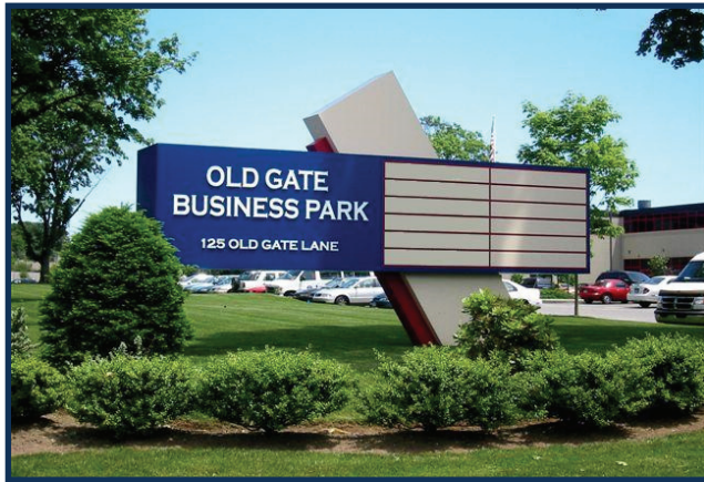
125 Old Gate Lane