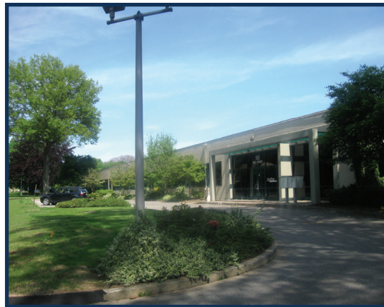
155 Hill Street