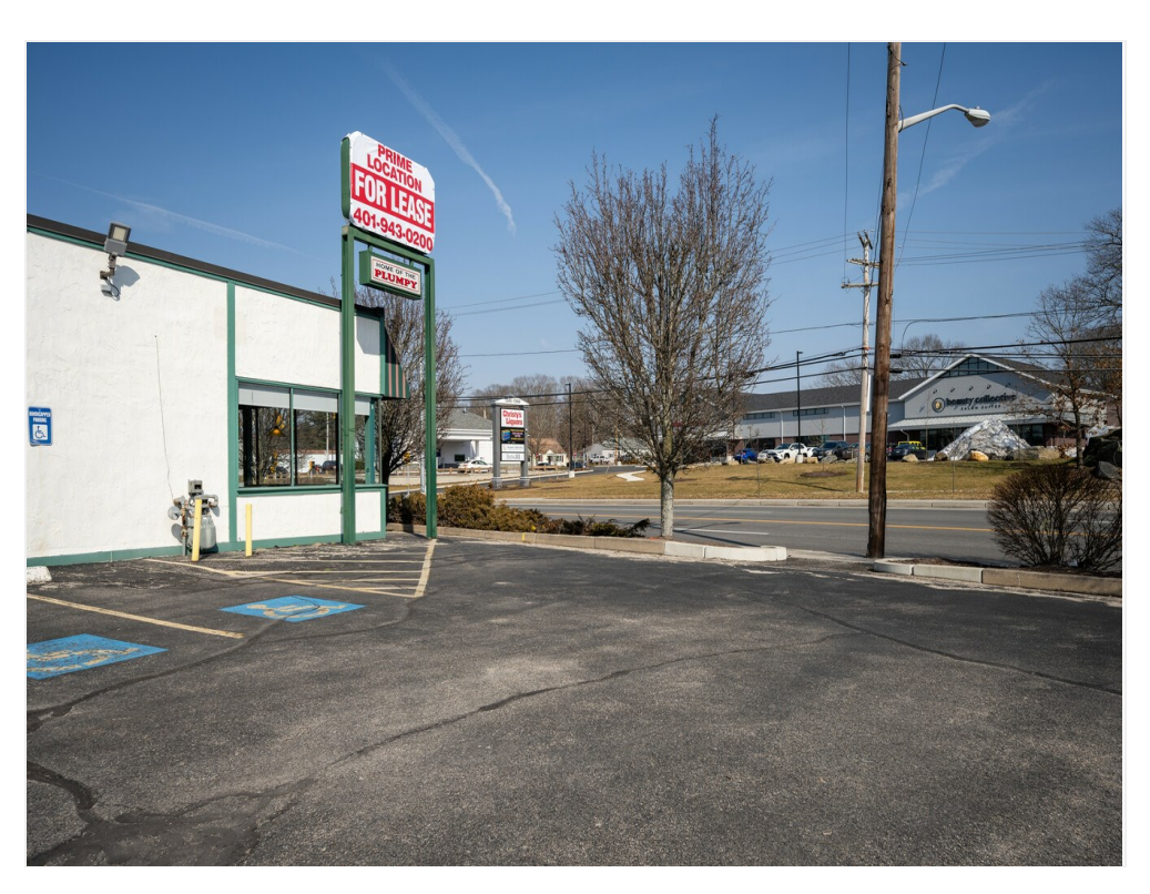
Entrance to 1455 Oaklawn Ave