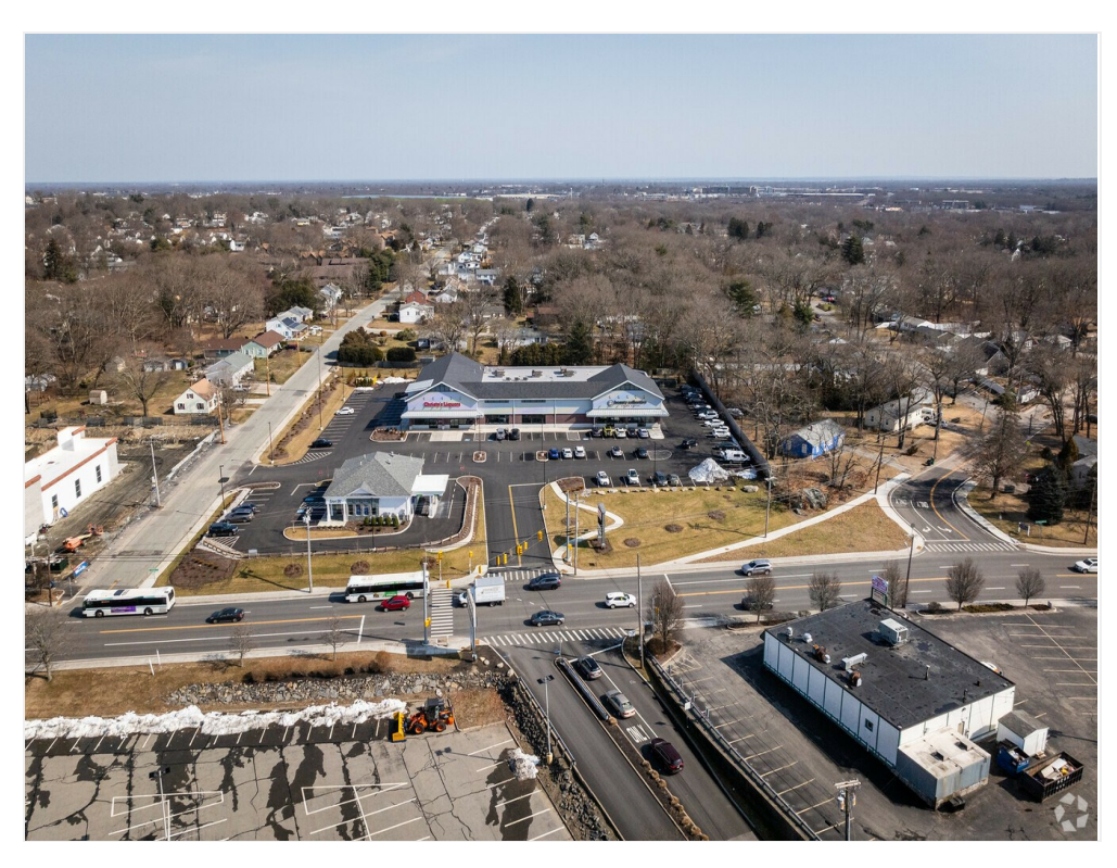
Aerial East View