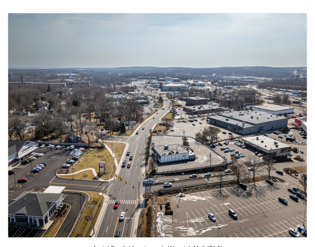
Aerial North East View