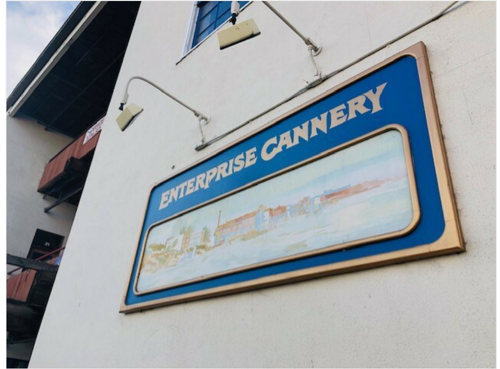
Enterprise Cannery Sign