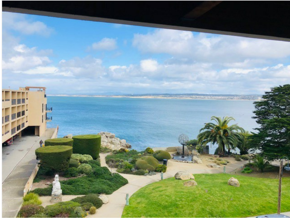
Enterprise Cannery View