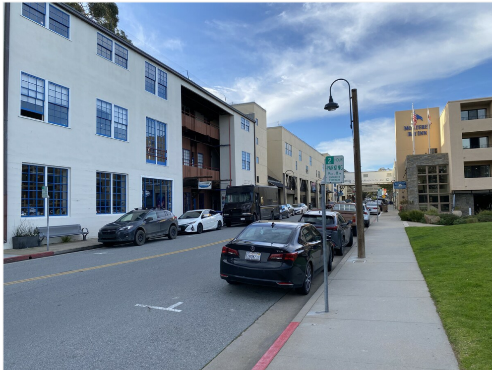
Building Exterior facing Cannery Row