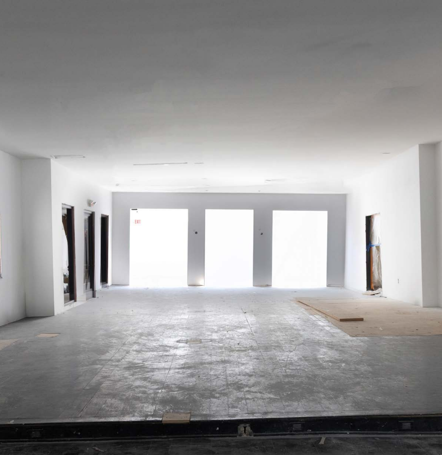
EXISTING INTERIOR FEATURING NEWLY RAISED CEILINGS. SPACE WILL BE DELIVERED IN WHITE-BOX CONDITION.