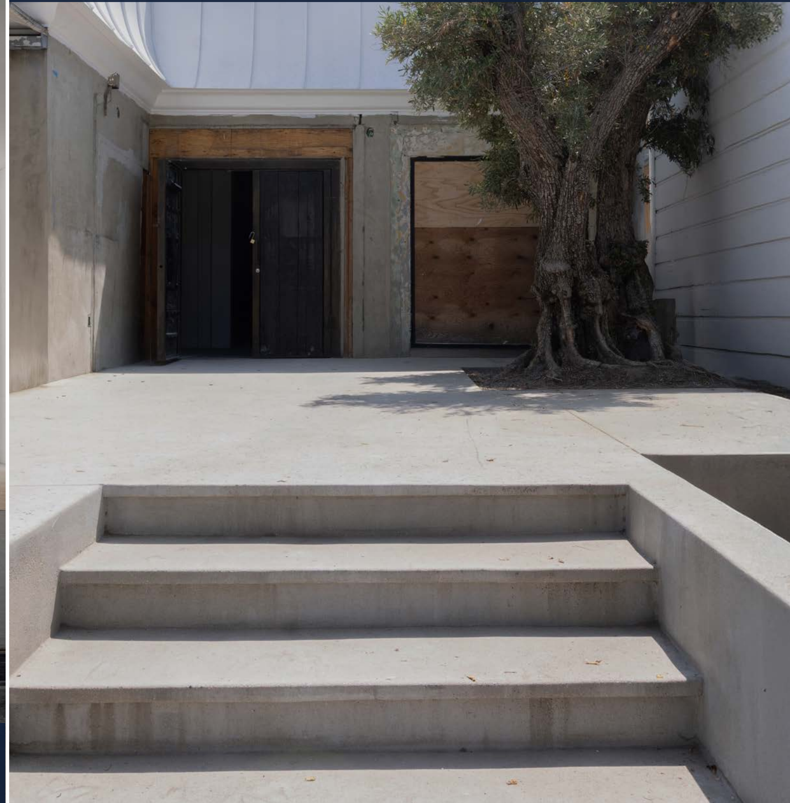
UPGRADED FRONT ENTRANCE WITH A NETW STAIRWAY, ADA-COMPLIANT LIFT, & A 10-FOOT ENTRY DOOR TO BE INSTALLED