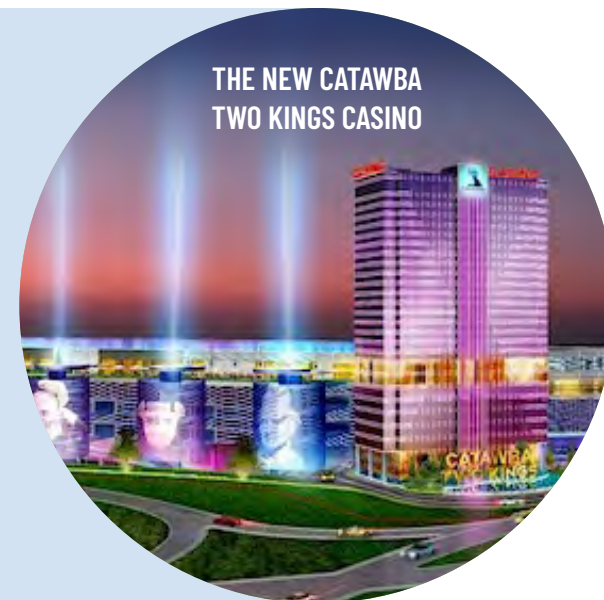
THE NEW CATAWBA TWO KINGS CASINO